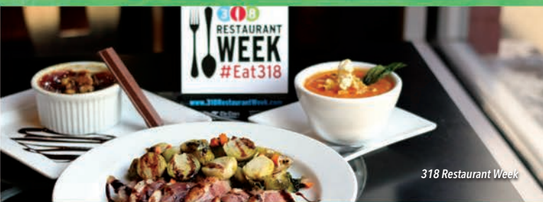
318 Restaurant Week