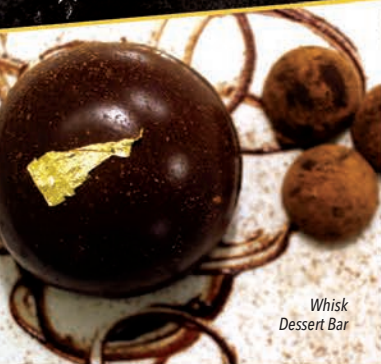
Whisk Dessert Bar

There's more to do than ever before in Shreveport-Bossier. With new shops, restaurants and attractions opening on a regular basis, we've hand-picked a few of our favorite new additions. For a complete list of things to do in Shreveport-Bossier, visit www.Shreveport-Bossier.org .