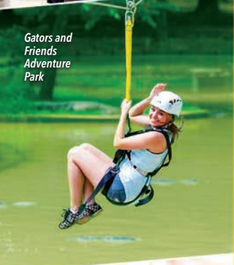
Gators and Friends Adventure Park