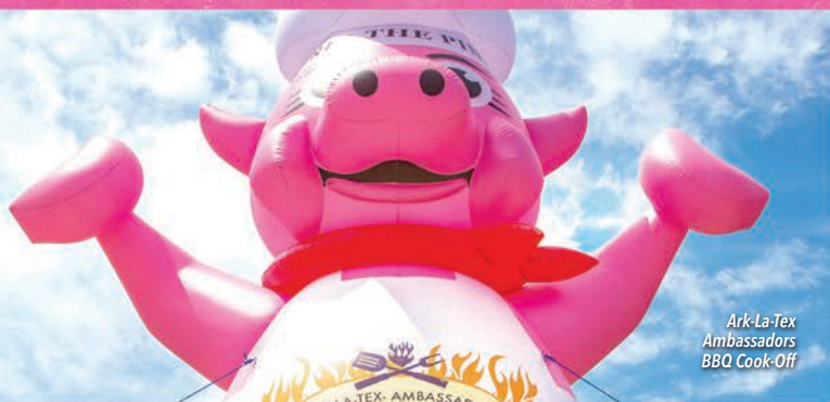
Ark-La-Tex Ambassadors BBQ Cook-Off