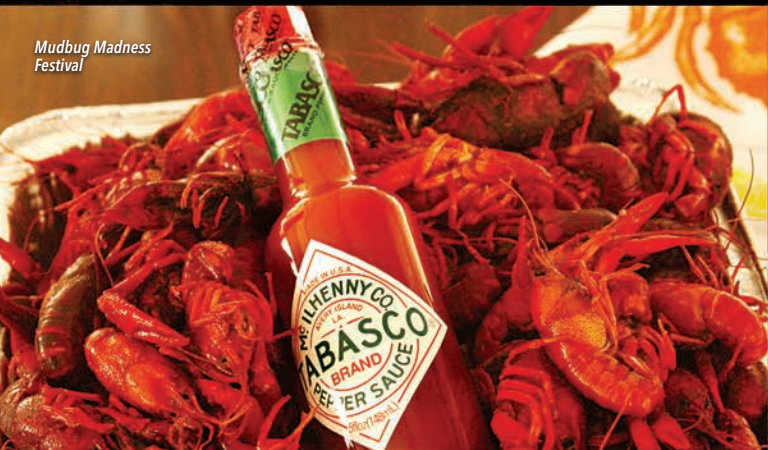
Mudbug Madness Festival