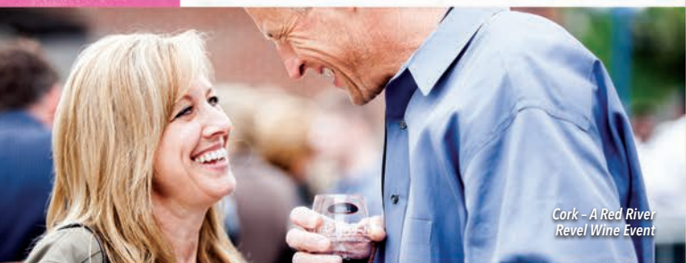
Cork - A Red River Revel Wine Event

318-865-5555 | www.arklatexambassadors.com