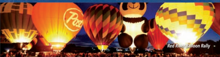
Red River Balloon Rally