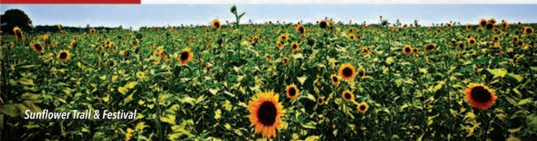
Sunflower Trail & Festival