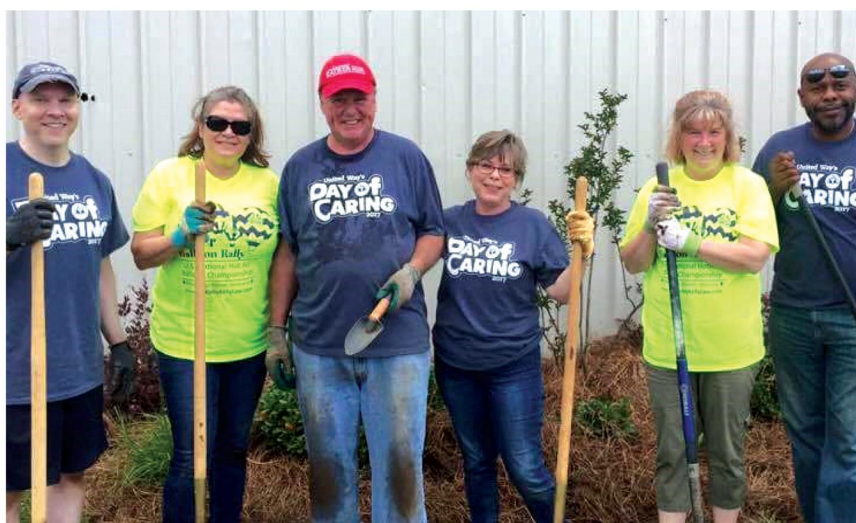
Staff from the Shreveport-Bossier Convention and Tourist Bureau and Shreveport-Bossier Sports Commission participated in the United Way of Northwest Louisiana's Day of Caring at the Bossier Educational Service Center, May 12.

The Tourist Bureau staff participated in the United Way of Northwest Louisiana's Day of Caring at the Bossier Educational Service Center, May 12.