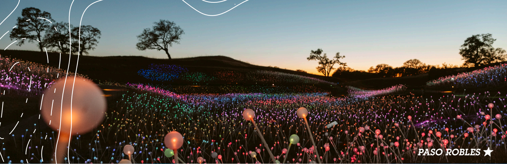
PASO ROBLES ★