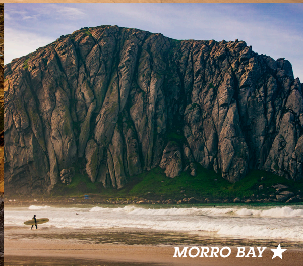
MORRO BAY ★