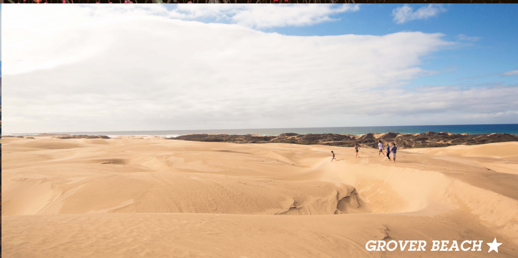
GROVER BEACH ★