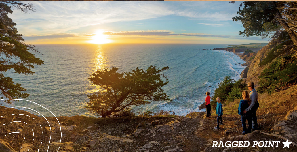
RAGGED POINT ★