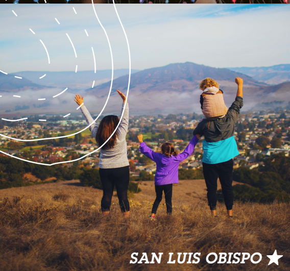
SAN LUIS OBISPO ★