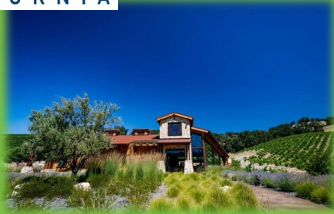
Halter Ranch Vineyard featured in Forbes (left) and San Luis Obispo featured in 7x7 (right).