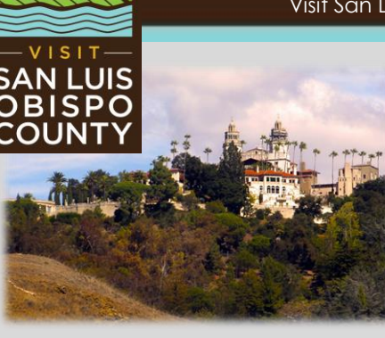
Featured on MSN: Hearst Castle (left); and in Chevrolet New Roads: Montaña de Oro (right).