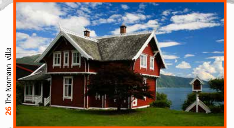
26 The Normann villa