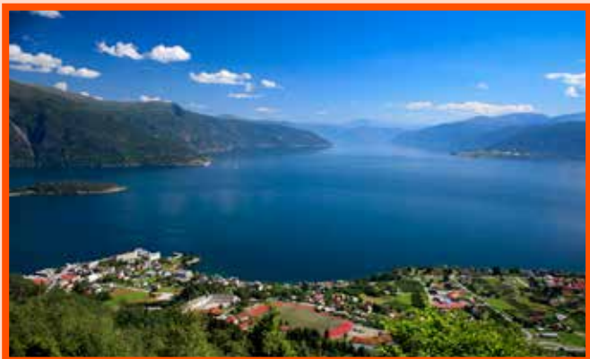
View from Orrabanken

Balestrand is almost at the midpoint of the Sognefjord, which is 180 kilometers long (112 miles). The depth varies from 100/200 meters at the mouth to 1303 meters at the deepest point. Between Balestrand and Vangsnes it is 1100 meters deep. Sea water fish common to the northern hemisphere are found in the fjord. Often seen are schools of porpoise, easily recognized by their rolling movement and breathing when they reach the surface. These are protected by law. The fjord is tidal.