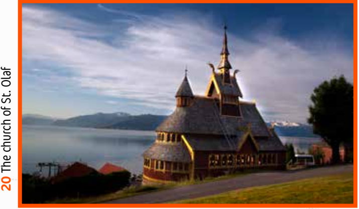
20 The church of St. Olaf