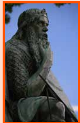
23 King Bele

26 The Villas We have a unique selection of villas, originally built by the resident artists during the years from 1890 – 1900s. Many of the villas were delivered from the Trondheim firm of Thams and Digre as prefabricated structures. Tall buildings with jutting roofs, verandahs and decorated gables often with dragonhead ornamentations. These were a symbol taken from the Nordic Sagas and the prechristian world of mythology. Balestrand has at least 6 different examples of dragonheads which can be seen from the Heritage Trail road. All villas are now privately owned.