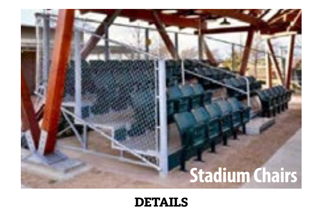
Even the simplest bleacher can offer comfort and style. The 25'10" long 4 Row Non Elevated Angle Frame bleacher seats 42 with the comfort of 20" wide team color stadium chairs. Note the color risers. Roof structure by others.