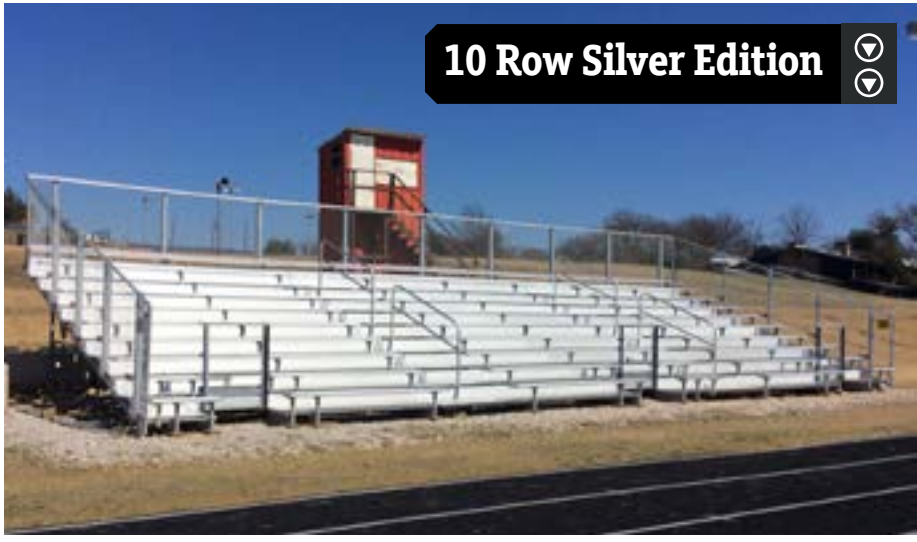
DETAILS 50' 10 Row Non-Elevated Silver Edition bleacher that seats 272. School districts across the country are making due with less funding. This Silver Edition unit features mud sills as there was no budget for a concrete slab.