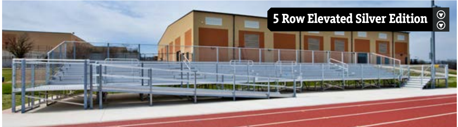
DETAILS 87' 5 Row Elevated Silver Edition bleacher that seats 240. Features an optional ADA ramp and wheelchair seating.