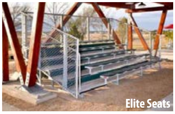
DETAILS Our 5 Row Non Elevated Angle Frame bleacher features our optional Elite Seat. This bleacher is 16' 1" long and seats 42 with a comfortable 18" wide Elite Seat in team color. Note the color risers and aisle at the end of the bleacher. Roof structure by others.