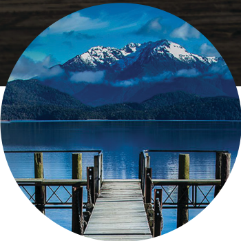
DAY TRIPS to Queenstown & Fiordland