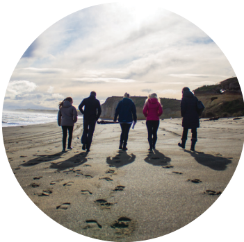
COASTAL GEOLOGY TOURS