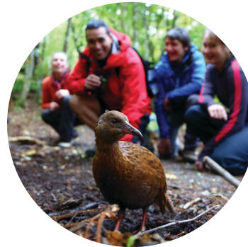
STEWART ISLAND MARINE AND BIRD TOURS scenic flights or ferry