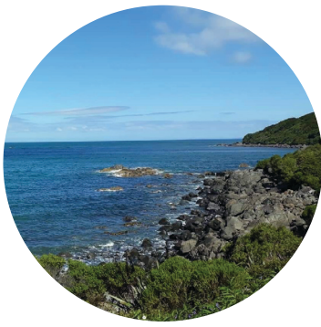
BLUFF WALKING TOURS