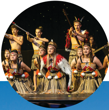
MAORI CULTURAL EXPERIENCES