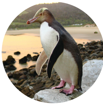
OVERLAND WILDERNESS TOURS in The Catlins