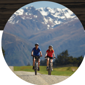
RECREATION & EXERCISE cycling, golf & stadium experiences