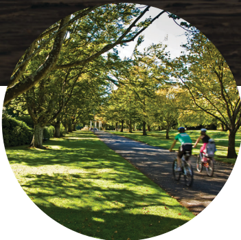
INVERCARGILL CITY SIGHTS TOURS arts, gardens, architecture & food options