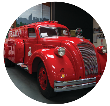
CLASSIC MOTORING COLLECTIONS in Invercargill