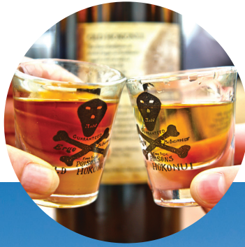
MOONSHINE & ART TOURS in Gore