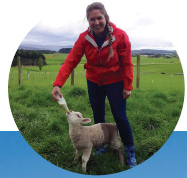
AGRICULTURAL EXPERIENCES farm tours