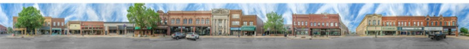
MAIN STREET + STEVENS POINT + JULY 2024

This dual approach ensures both immediate vibrancy and long-term transformation.