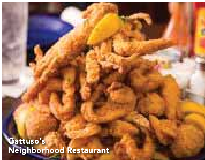
Gattuso's Neighborhood Restaurant