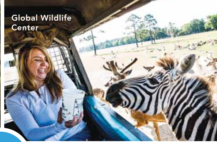
Global Wildlife Center