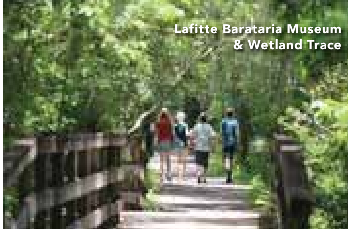
Lafitte Barataria Museum & Wetland Trace