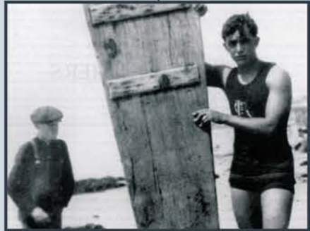
GEORGE FREETH: FIRST SURFER EVER AT THE HB PIER