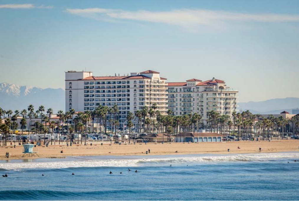
The Waterfront Beach Resort, a Hilton Hotel