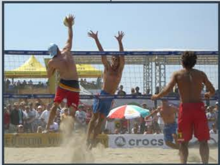
AVP BEACH VOLLEYBALL HUNTINGTON BEACH OPEN