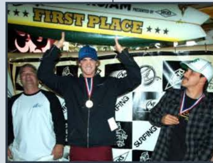
KATIN PRO-AM TEAM CHALLENGE