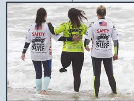
FIRST OPERATION SURF EVENT FOR WOUNDED VETERANS