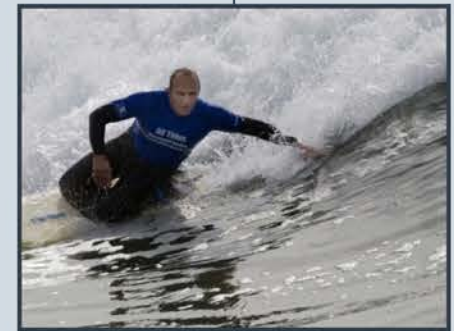
KNEEBOARDING SURFING USA TITLES