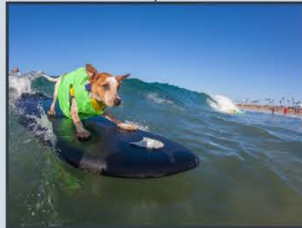
FIRST SURF CITY SURF DOG EVENT AT HB DOG BEACH