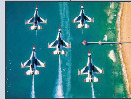
BREITLING HUNTINGTON BEACH AIRSHOW