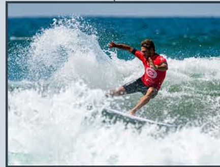
ISA WORLD SURFING GAMES