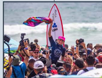
US OPEN OF SURFING