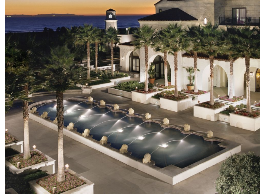
Hyatt Regency Huntington Beach Resort & Spa