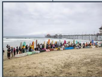
A GREAT DAY IN THE STOKE (BACK IN 2023)