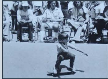
HUNTINGTON BEACH CITY SKATEBOARD CONTEST