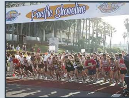
CITY'S FIRST RACE (PACIFIC SHORELINE MARATHON)