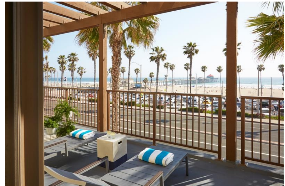
Kimpton Shorebreak Huntington Beach Resort