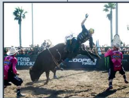
BULLS AT THE BEACH & FIRST HB SAND SOCCER EVENT