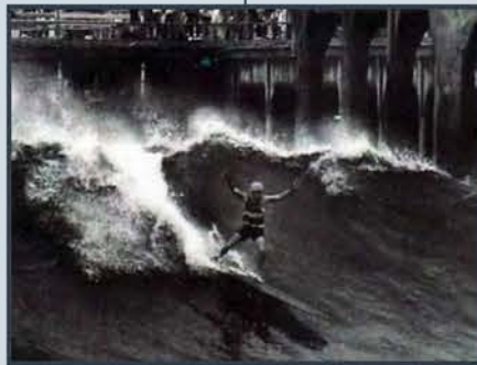
FIRST WEST COAST SURFING CHAMPIONSHIPS