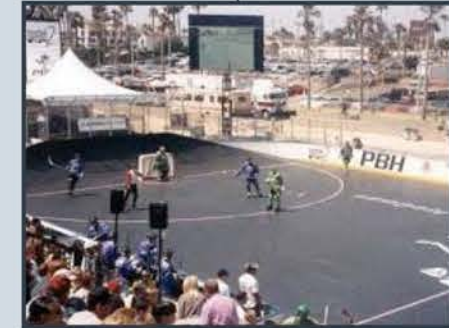
HUNTINGTON BEACH PRO BEACH HOCKEY