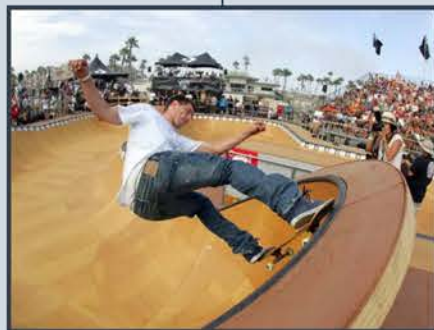
HURLEY INCLUDES SKATEBOARDING AT U.S. OPEN OF SURFING