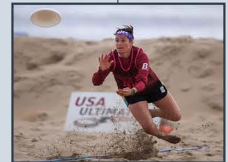
USA BEACH ULTIMATE