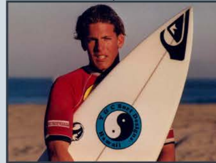
FIRST NSSA NATIONAL CHAMPIONSHIP