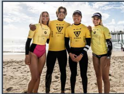
ISA WORLD JUNIOR SURFING CHAMPIONSHIPS