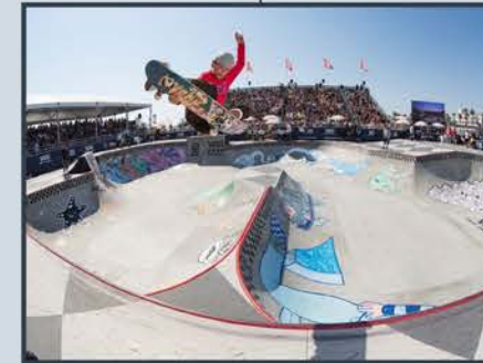
VANS WORLD CHAMPIONSHIP SKATEBOARDING GLOBAL QUALIFIER