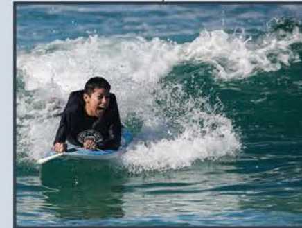
ISA WORLD PARA SURFING CHAMPIONSHIPS