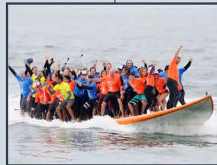
HB SETS TWO GUINNESS WORLD RECORDS AT THE PIER