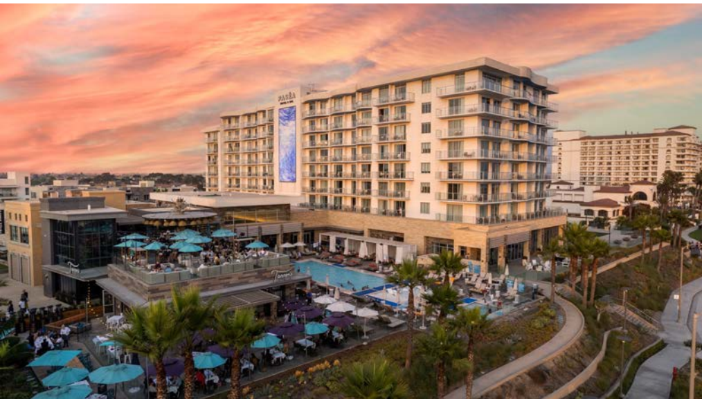
Paséa Hotel & Spa