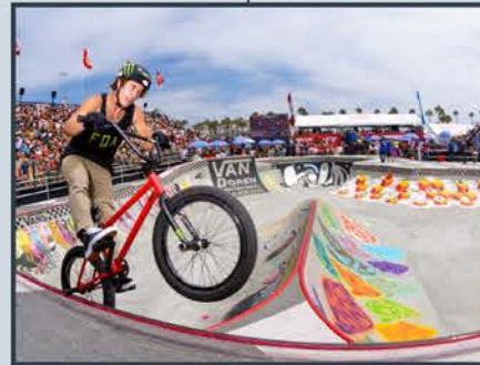
VANS INCLUDES BMX AT U.S. OPEN OF SURFING