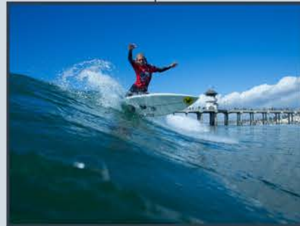
TOYOTA USA SURFING PRIME