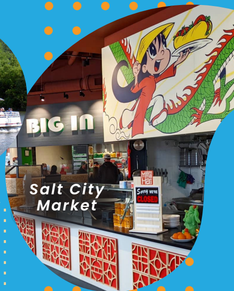
Salt City Market

Choose dinner at Stone’s Lakeside while enjoying wonderful views of Oneida Lake, or the original, nationally-acclaimed, finger-licking good Dinosaur Bar-B-Que .