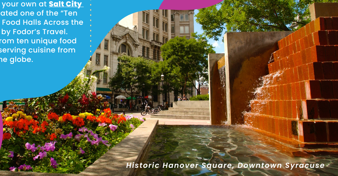
Historic Hanover Square, Downtown Syracuse