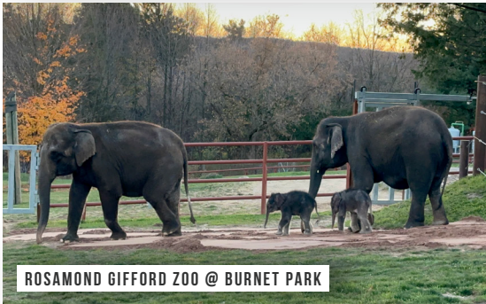
ROSAMOND GIFFORD ZOO @ BURNET PARK

The Erie Canal Museum: Located in the 1850 National Register Weighlock Building, the last remaining structure of its kind, student field trips are available year-round ( Mon - Fri / 9:30a - 3p ) and include a docent-led tour of the museum and time for educator-led activities. Known as one of the greatest feats of engineering in its time, the man-made Erie Canal connected the Hudson River to Lake Erie, opening New York State to an influx of trade and ease of movement.