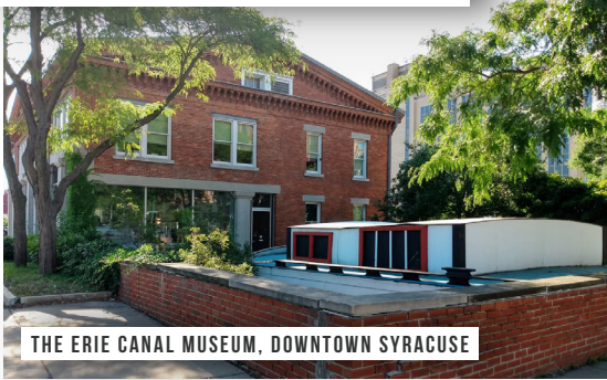
THE ERIE CANAL MUSEUM, DOWNTOWN SYRACUSE