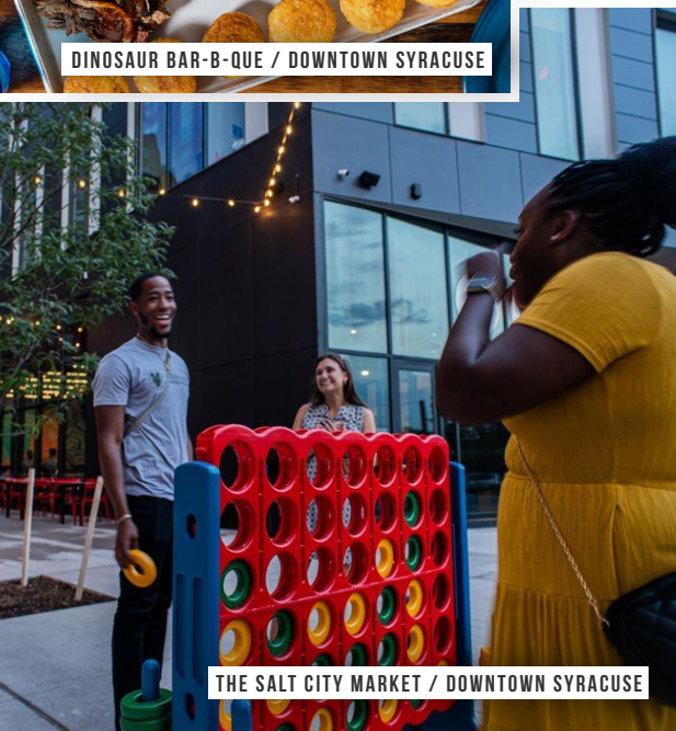
THE SALT CITY MARKET / DOWNTOWN SYRACUSE