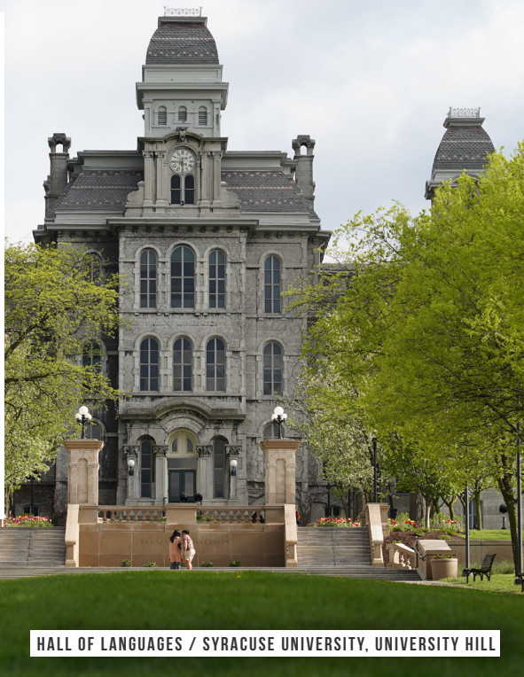
HALL OF LANGUAGES / SYRACUSE UNIVERSITY, UNIVERSITY HILL

Syracuse University: Founded in 1870, students will enjoy a student-guided tour of this iconic campus, based on availability, or admire the grounds on a self-guided tour. Fun Fact : President Biden, Dick Clark, Lou Reed, Bob Costas & Jerry Stiller all attended Syracuse University.