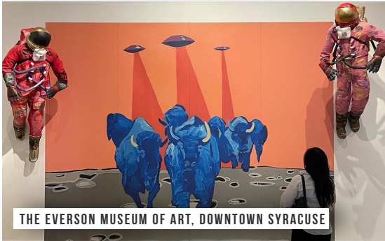
THE EVERSON MUSEUM OF ART, DOWNTOWN SYRACUSE