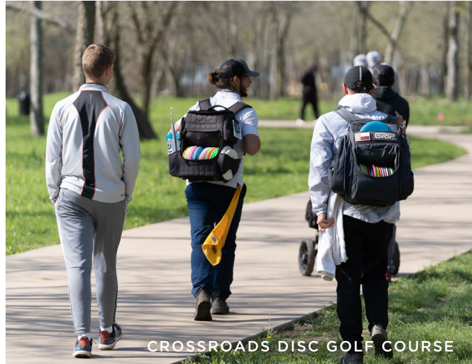
CROSSROADS DISC GOLF COURSE