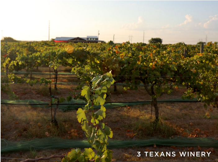
3 TEXANS WINERY