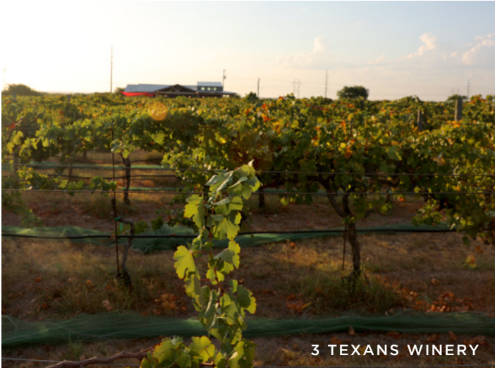
3 TEXANS WINERY