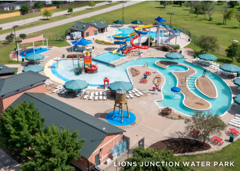
LIONS JUNCTION WATER PARK

Fill your days with endless fun and entertainment on your next trip to Temple. Spend your free time experiencing our local attractions and things to do. Whether traveling in a small or large group, there's plenty to do and see in our exciting destination.