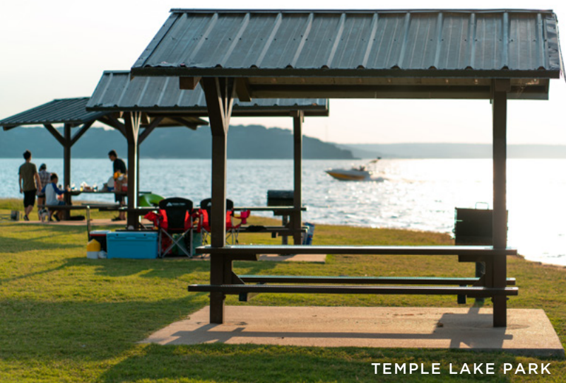
TEMPLE LAKE PARK

So often we find ourselves in a traveling mood to see the sights and get outdoors. Between the trails, the lake, and the parks, Temple has the outdoor experience you have been searching for.