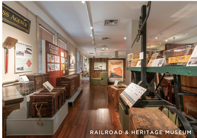
RAILROAD & HERITAGE MUSEUM