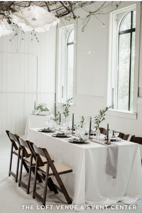
THE LOFT VENUE & EVENT CENTER