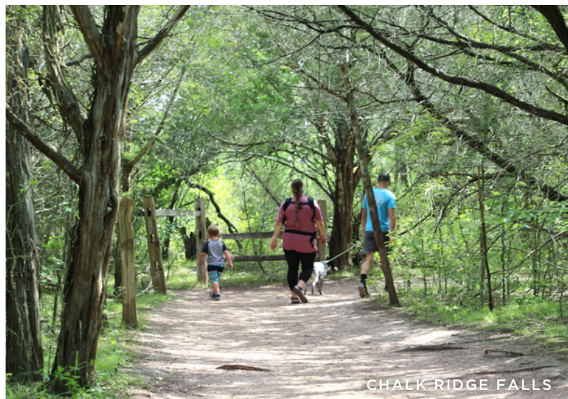
CHALK RIDGE FALLS