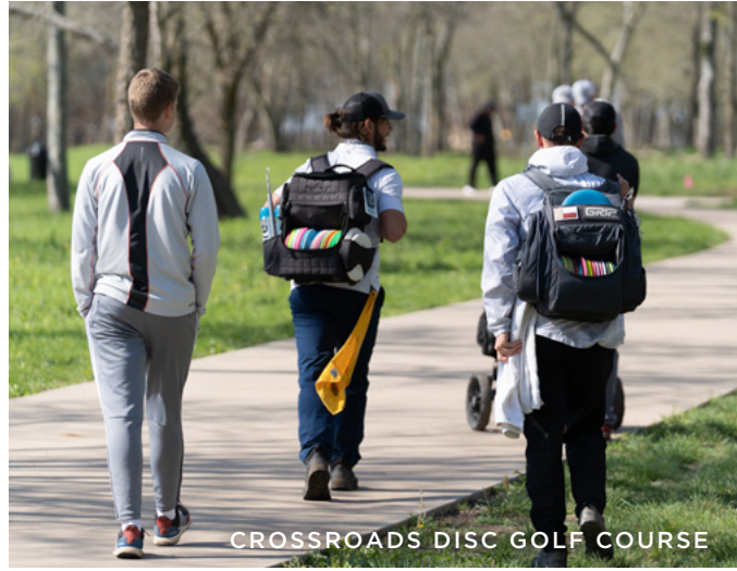
CROSSROADS DISC GOLF COURSE