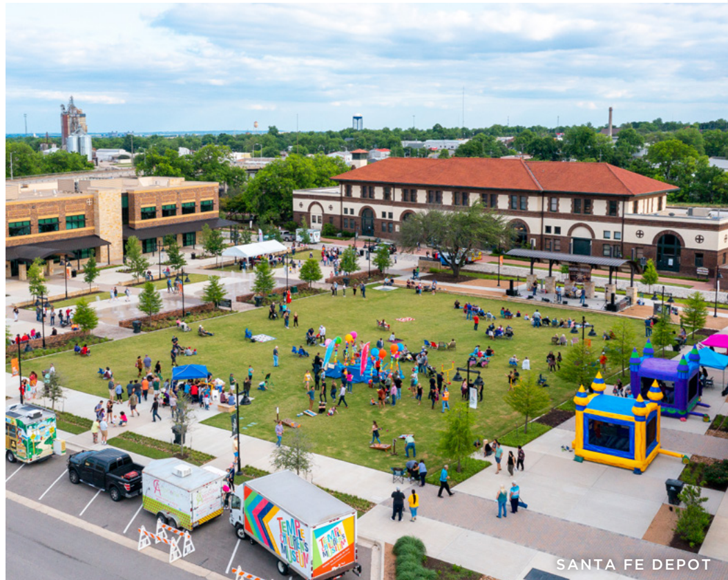
SANTA FE DEPOT