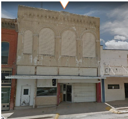
Current View of 114 S 1st Street