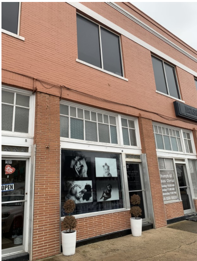
Current View of 7 W Central Ave.