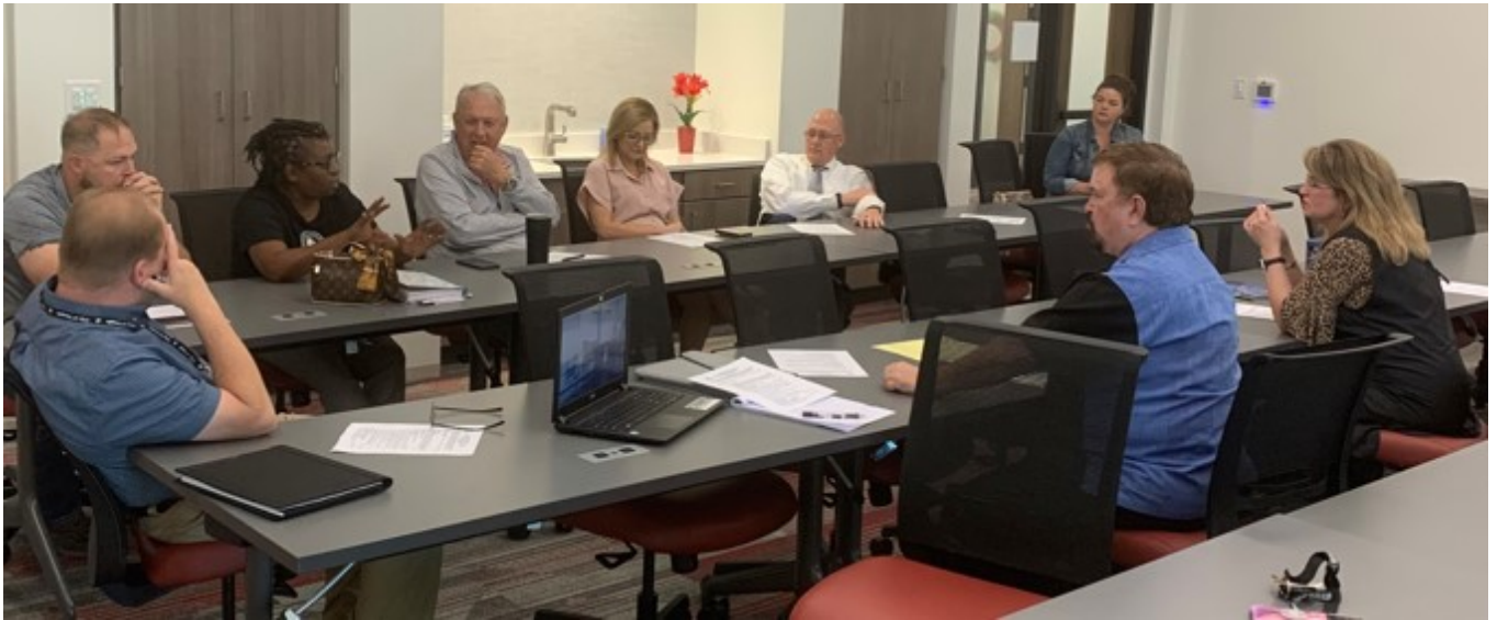
The Main Street Economic Vitality Committee met on April 5th