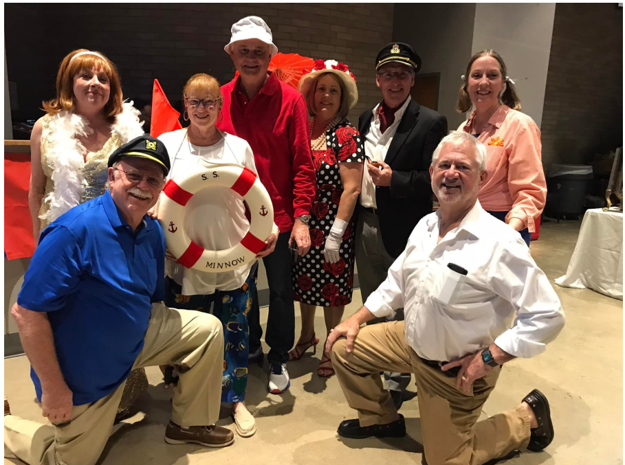
The shipwrecked crew from Gilligan's Island were among the costumed guests at the Temple Children's Museum's 2nd Annual Celebrity Host Dinner