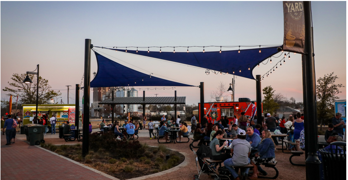
There was a very good crowd at The Yard Food Truck Plaza on First Friday, April 1st