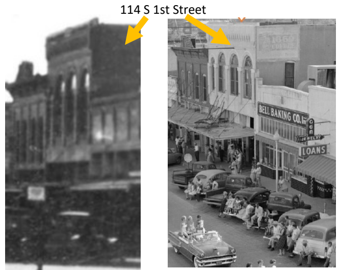
Historic views of 114 S 1st Street from 1921, center, and 1955, right