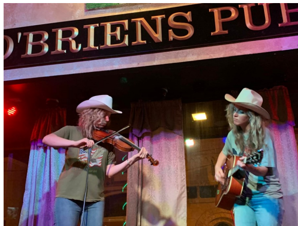
The Tequila Songbirds performed a live show on First Friday at O'Briens Irish Pub