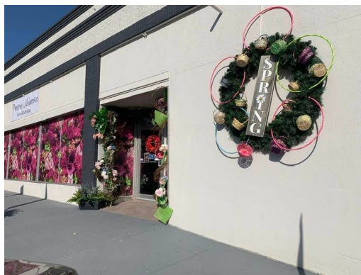
The decorations at Precious Memories won the Champion's Trophy in the downtown spring decoration Contest