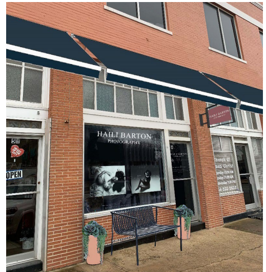
Two alternate options proposed by TMSP Designer's

The TMSP designers recommended the removal of unused cables and metal plates that had been added to the sides of the masonry columns and the repair and painting of the wooden frames of the transom windows. The report also recommended adding a new blade sign to be placed perpendicular to the building's front wall and that will inform and announce the business to pedestrians passing on the sidewalk. Also, the report recommended the addition of awnings to protect people entering and exiting the shop from the weather and to create a more welcoming and appealing entry environment.