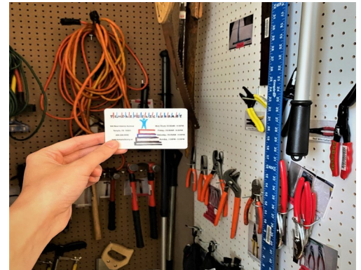
People can check out tools from the Temple Tool Library with a library card from the Temple Public Library