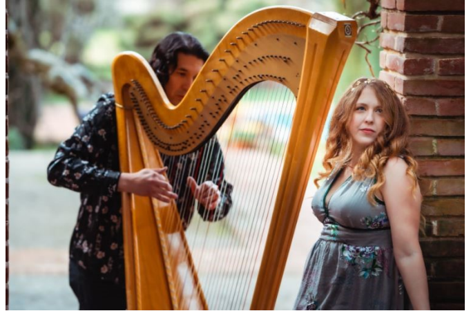
The musical duet, 'Amber Dreams' will perform live at the 'Down @ The Yard', event at 'The Yard' food truck plaza

It was also noted that on March 11 th , the Temple Parks & Rec. Dept. plans to stage another of its quarterly music events at The Yard Food Truck Plaza called 'Down @ The Yard', and on that evening the duet, Amber Dreams will perform live.