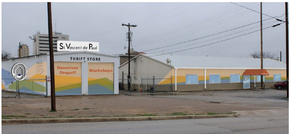
A TMSP designer's vision for a possible new sign and color pallet at St. Vincent De Paul