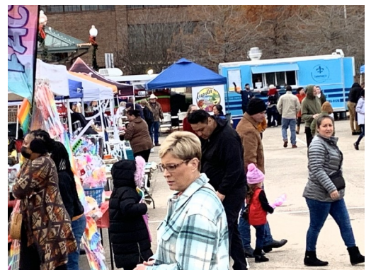
Food Truck Frenzies have become very popular on downtown Market days

The next item discussed by the committee was a report on activities of the Marketing & Communications Dept. Teresa Anderson passed out some new QR code window clings to committee members. The QR code offers a web-link to a downtown digital map with helpful information about the locations of downtown shops, restaurants and attractions, and information about downtown promotional activities.