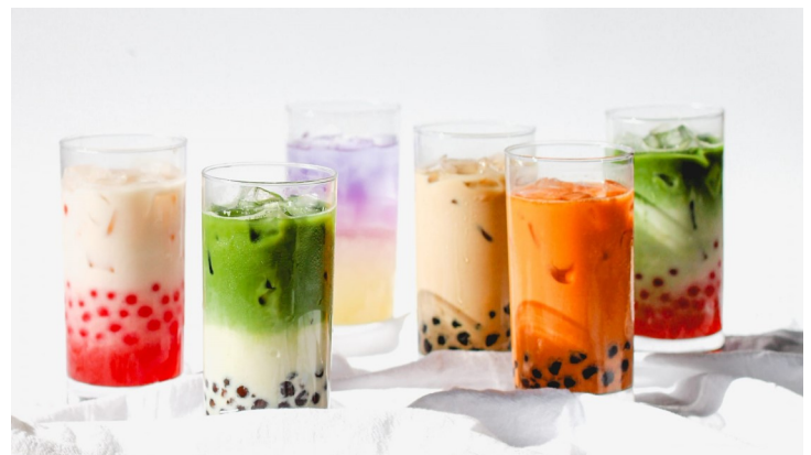
'Cha Community' plans to open their new boba tea shop on First Friday, March 4th

Also, the new boba tea shop, 'Cha Community' will open its doors for business on March 4th. This new tea shop will be located at 7 N Main Street.