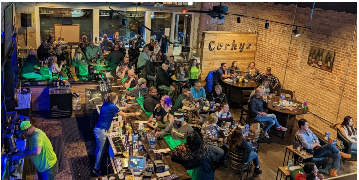
Corky's Wine & Beer Bar has become a popular downtown spot for drinks and live entertainment