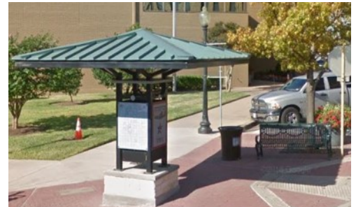
The messages on the downtown kiosks will be updated soon