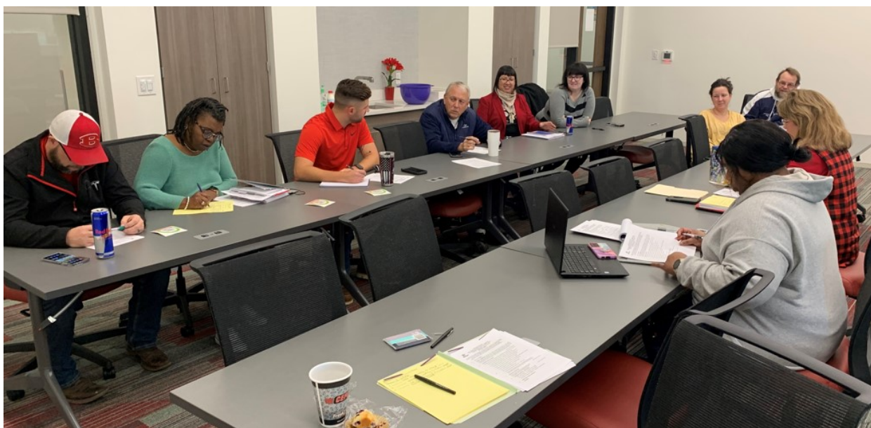
The Main Street Economic Vitality Committee meeting of February 8th