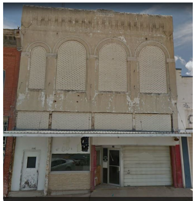
114 S 1st Street