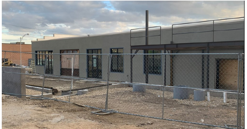
The windows are going in at the new Bird Creek Brewing at 8 S 4th Street