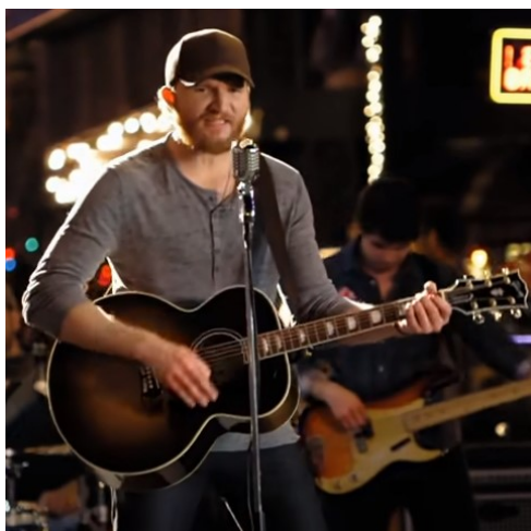
Eric Paslay will be the headlining act at the Lions Club Music Festival on April 1st at the MLK Festival Grounds