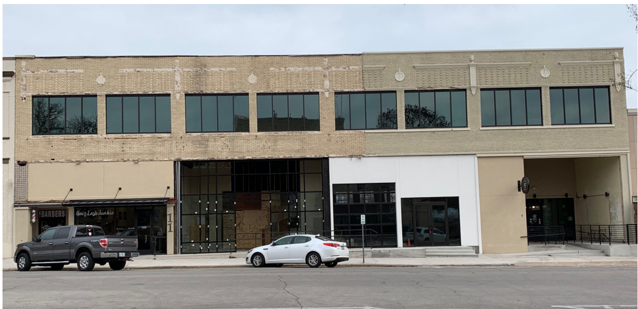
The windows are going in at the Wilkes Building at 7-11 N Main Street

Also, property owner, Travis Wilkes, told the committee that his glass storefront at 7 – 11 N Main Street would be installed soon, and that he is still looking for a tenant for a 4,000 square-foot space at this location.