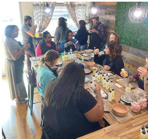
Wick & Burn, offers candle-making classes for those who want custom-designed candles

The group also discussed the continuing tenant improvements at Weird Doughs Bakery & Café at 11 North 6th Street and they said they were looking forward to the opening of this new restaurant within the next few months.