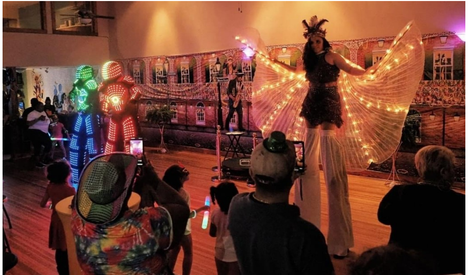
The LED-Lighted Stilt Walkers will be at the Mardi Gras Celebration at Total Elegance Creations