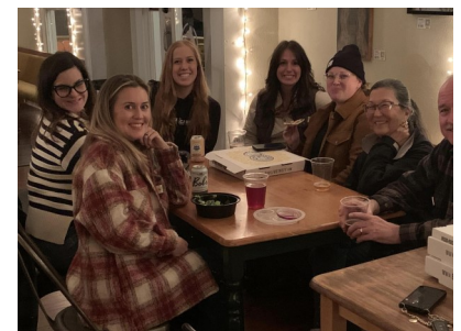
There was lots of fun nightlife at the First Friday event on February 3th

Also, on February 4th, the Temple Railroad & Heritage Museum held it's Geek Out Family Day event.