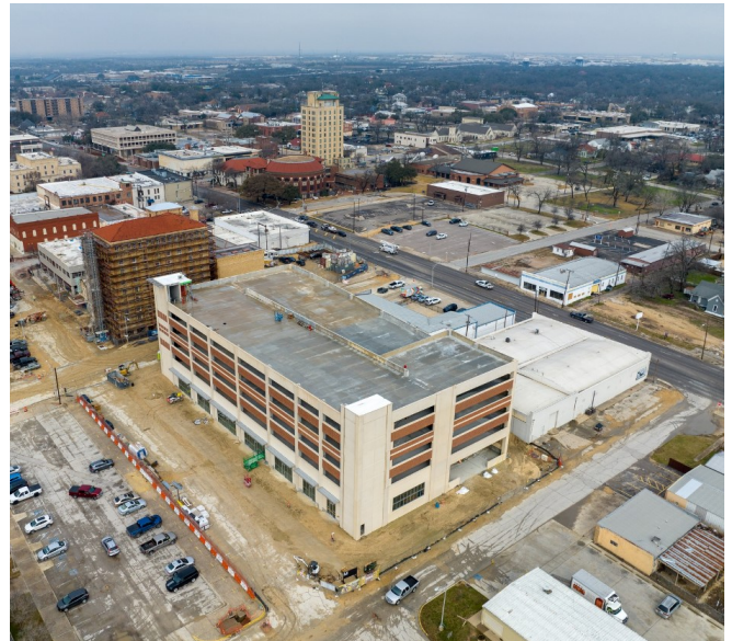
The 4th Street Parking Garage will open soon

The last item on the committee agenda was a discussion of any items that members would like to see on upcoming agendas. Committee members asked for an update on the homelessness issue when the regional homelessness study is complete and for periodic updates on City Parking Policy.