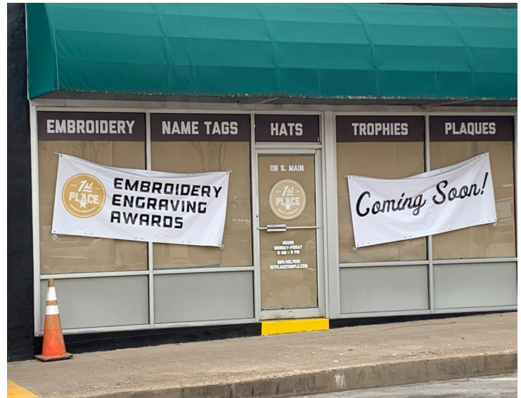
The building at 118 S Main Street is sporting signs that say '1st Place Embroidery, Engraving & Awards', and 'Coming Soon'