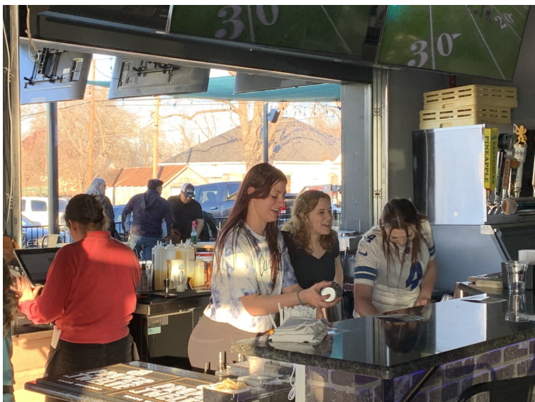
The indoor-outdoor bar at HatTrick Sports Bar has been kept busy since their opening at the beginning of February

Committee members also talked about the new business, Wick & Burn Candle Shop, located at 8 E Ave A, that had held their opening ribbon cutting ceremony on Friday, February 3rd. Members who attended their opening said they had a large turnout. Wick & Burn Candle Shop sells candles, and it offers candle-making classes for people who want to custom-design their own candles. They also offer refreshments so guests can have a drink while crafting their fancy flambeaus.