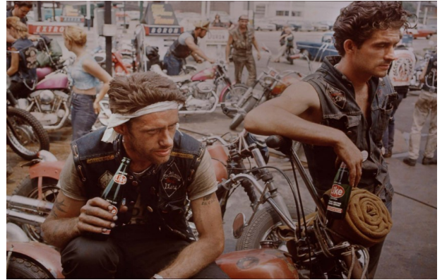
The exhibit, 'Danny Lyon: Bikeriders' will open at the Railroad & Heritage Museum on April 22