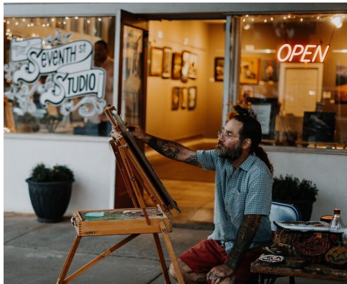
Outdoor Painters will visit Temple on February 18-19 to paint local scenes