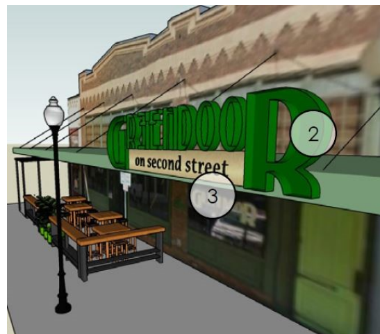
Outdoor seating design proposed for 'Green Door' by the TMSP design service office