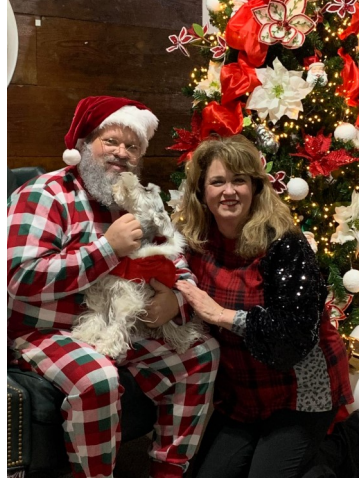
Casual Santa in his pajamas visited Precious Memories Flower & Gift Shop on First Friday.