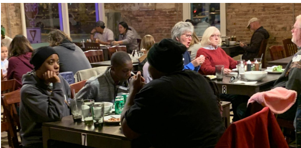
La Dalat Vietnamese Cuisine also had a good crowd on the chilly First Friday evening