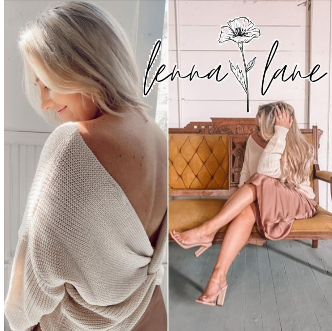
Lenna Lane is an upscale ladies clothing and gift boutique that is currently located inside The Hub.