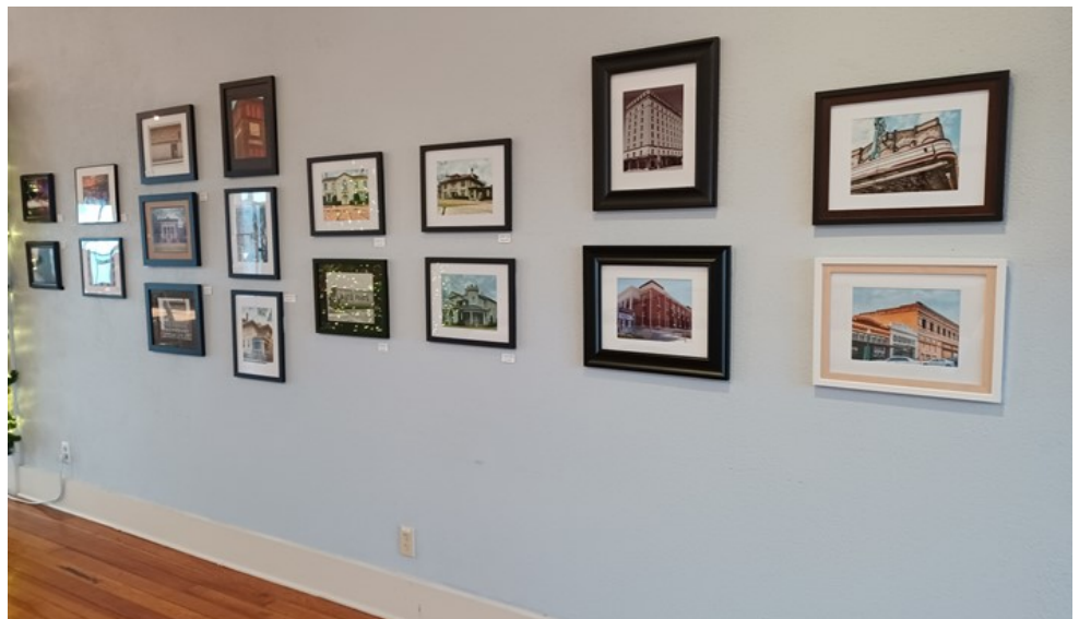
The 2021 Temple Community Treasures Photography Contest will remain on public display for a few more weeks at the Bell County Museum

Kelleher also told the committee that the 2022 Community Treasures Photo Contest was now open and that framed photo entries will be accepted through March 31st. He added that that the contest judging will take place in April, contest prizes will be awarded in May, and the contest entries will then be compiled into a new 2022 Community Treasures Photo Exhibit that will once again be displayed at several local museums through 2022.