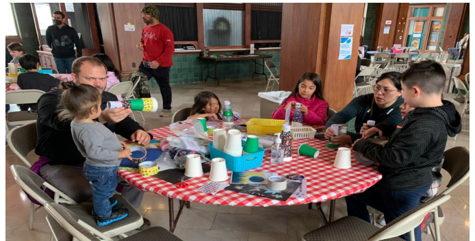
Kids worked on educational crafts at Fire Safety Family Day