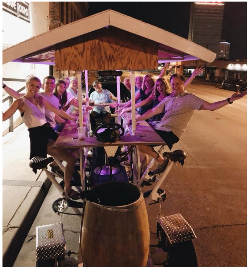
Total Elegance Pedal Bike Tours will start on First Friday, March 3rd