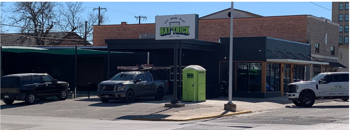
Work on Hat Trick Sports Bar at 217 N Main Street is nearly complete

Also, committee members noted that the owners of Hat Trick Sports Bar and Soccer Training Center, at 217 N Main Street, are making good progress on their tenant improvements and they should be open soon; and they also noted that the owners of Melody's Brunch & Cocktails, at 116 South 1st Street, are currently working on obtaining their building permits and SIZ grant funding; and they also noted that the new Bird Creek Brewing, at 8 S 4th Street, is expected to open in the 2nd quarter of 2023.