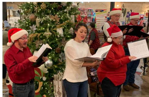
Las Voces Chorus roamed around to carol at downtown shops

Several committee members said that the First Friday on December 2nd had a great turnout, and that there was live music at several downtown bars and also there were roving carolers from Las Voces Chorus and Christmas violin music from the AMCT 'Virtuosos'. There were also several block parties and ribbon cutting ceremonies to launch new businesses and expansions at 'Lenna Lane Boutique' and at 'The Grill at Mo's', and a Christmas toy drive at Fire Base Brewing.