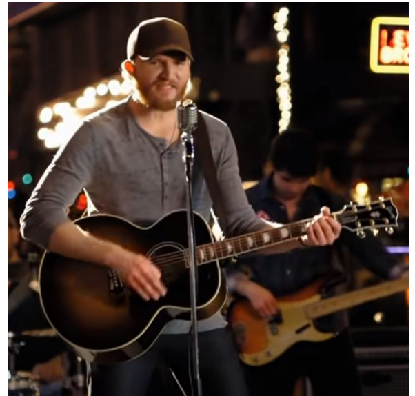
Eric Pasley will be the headlining act at the Lions Club Music Festival on April 1st in the MLK Festival Grounds