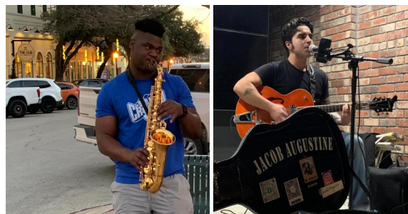
There was lots of live entertainment at the First Friday event on January 6th