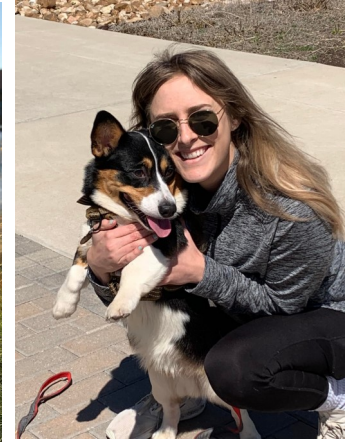
Dogs & their owners will take over Santa Fe Plaza on March 25th.