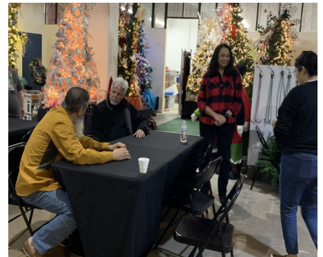
Lots of people turned out for the Small Business Saturday reception at Precious Memories-Downtown

After that, the committee discussed the recently submitted 6-standard national accreditation report, the status of the processing of our annual Main Street Contract, advance planning for the Chamber of Commerce 'Business After Hours' reception that the Temple Main Street Program and Downtown Businesses and organizations will host in April, and our upcoming community observances of Preservation Month.