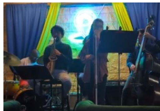
‘Aji’ performed live at Corky’s on January 19th.