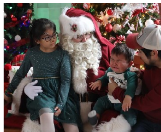
They say you can't please all the people all the time. But most kids had fun at 'Santa at the Depot'