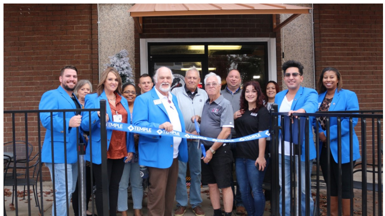
Mo's Railyard Saloon celebrated its expanded square footage and addition of a full restaurant kitchen with a ribbon cutting ceremony earlier this month

The next issue on the committee's agenda was support for downtown business expansion. Committee members noted that several businesses are now expanding their operations in downtown Temple. Mo's Rail Yard Saloon, for example, has expanded into the space previously occupied by PJs Tabletop, and opened 'The Grill at Mo's'. 'The Grill at Mo's' had its grand opening ribbon cutting ceremony on January 6, and they expanded both their square footage and their business services by opening a full commercial kitchen and a full restaurant.