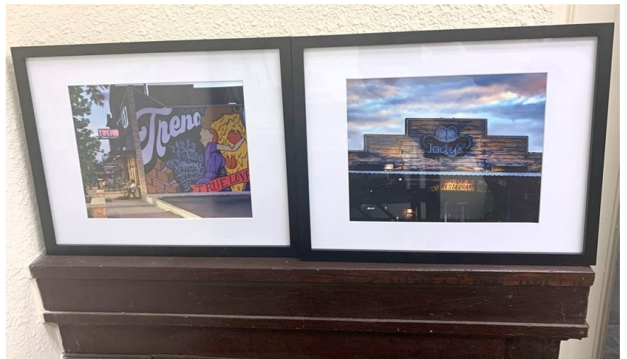
Two of the early submissions in the Temple Community Treasures Photography Contest