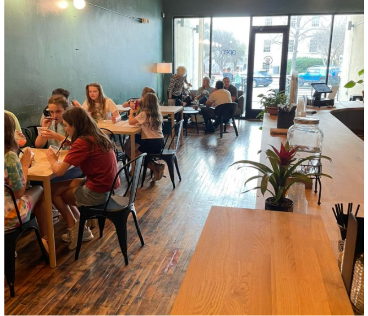
'Cha Community' Boba Tea Shop is now open at 7 N Main St.