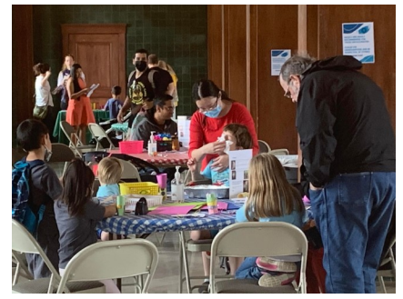
Fiesta Family Day at the Temple Railroad & Heritage Museum