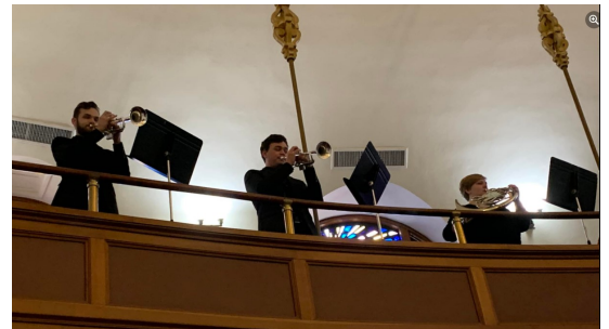
The UMHB Brass Ensemble played a Sunday afternoon concert in downtown Temple