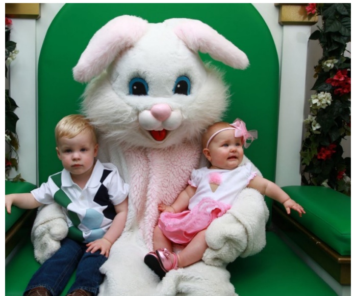
The Easter Bunny Will Make a Special Guest Appearance at Total Elegance Creation on April 1st