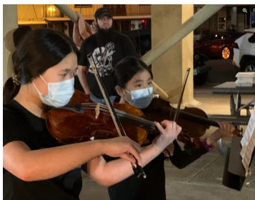
The AMCT 'Virtuoso Violins'