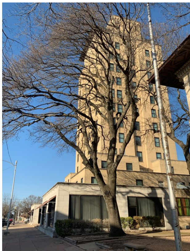
This space at the base of the Kyle Hotel, on it's southern side, has become available. It offers 2,700 square feet

Committee members noted that one of the commercial spaces at the base of the Kyle Hotel at 111 North Main Street had recently become available, and that the space offers 2700 sq. ft of commercial space on the ground floor of the building.