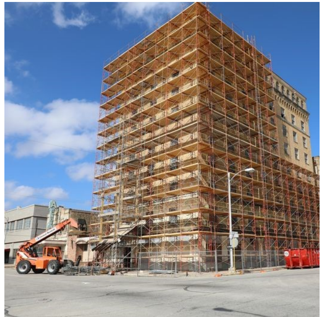
The restoration of the Hawn Hotel is underway