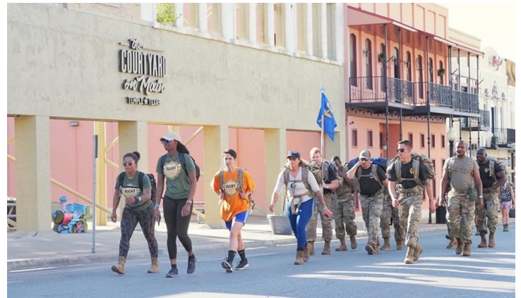
Both active duty professionals and amateur ruck marchers are welcome at 'Rucks on Main' on Saturday, May 28th

'Rucks On Main' is a military-themed ruck march held twice a year at the Santa Fe Plaza in downtown Temple. Those who participate in the May 28 event will fill their backpacks with up to 40 pounds of non-perishable food items and carry those packs as they walk or run over a 6-mile route through downtown Temple and the historic neighborhoods of north Temple. Before the ruck march, each participant will receive a t-shirt, and upon completion each participant will receive a challenge coin, and they will drop-off their food items to be donated to charitable organizations. Participants can register online or in-person on the day of the event. Access to online registration can be found at: https://rucksonmain.org/