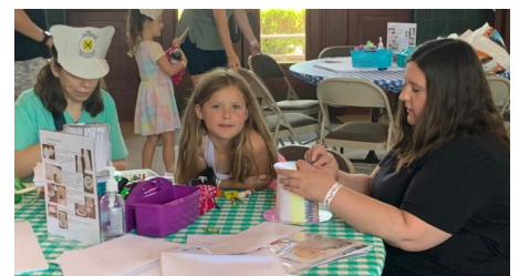
National Train Day