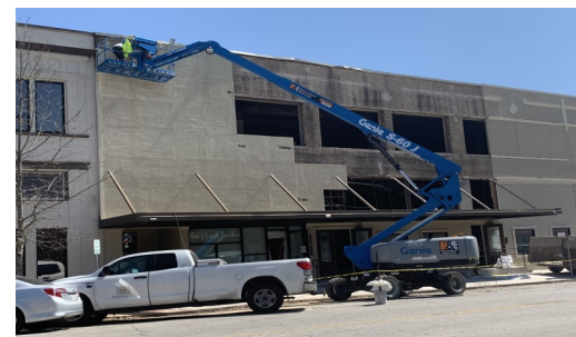
9 N Main St