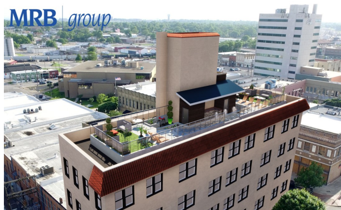
Designers vision for the Central Plaza building

First, McKenzie Wilby of MRB Group and other committee members reported that the windows for Professional Building/Central Plaza at 103 E Central Avenue had finally arrived. She explained that most of the interior construction had been placed on hold until the windows could be installed thus to protect the building's interior from the elements; and that now, the interior construction work will be able to begin in earnest.