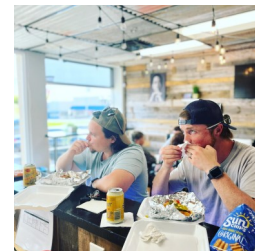
Guests enjoy a quick, convenient meal at the lunch-counter at 'J & M Dogs & Paninis'