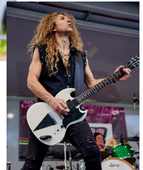
'Market Trail medley - A Lil' Bit o' Bloomin' was held on April 29 & 30