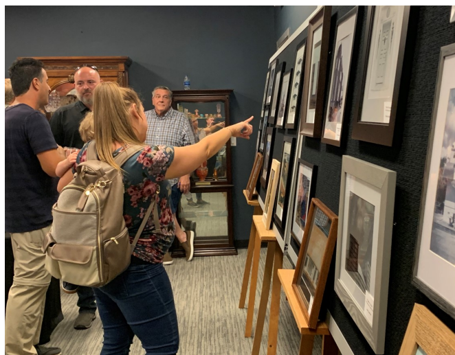
There was a good turnout at the opening reception for the Temple Community Treasures Visual Arts Exhibit that featured photos and paintings of historic buildings in Temple.