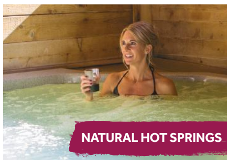
NATURAL HOT SPRINGS