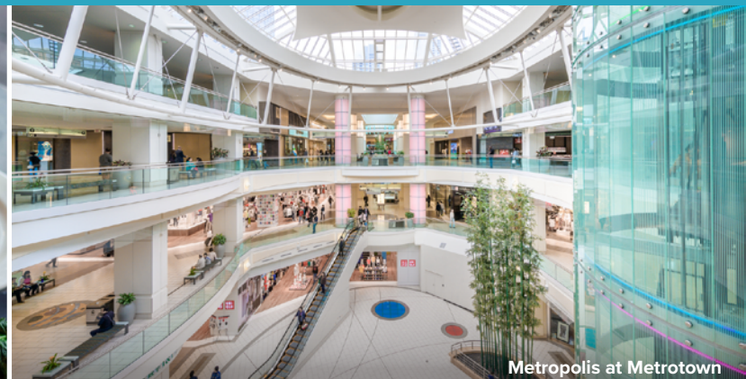
Metropolis at Metrotown