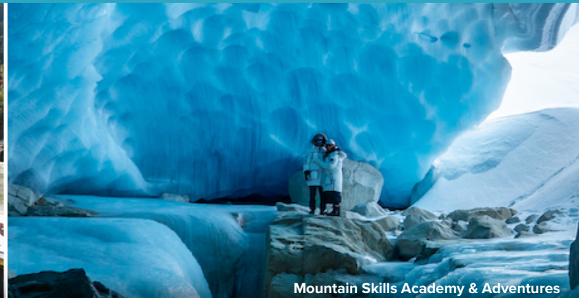
Mountain Skills Academy & Adventures