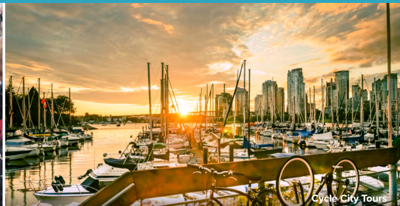
Cycle City Tours