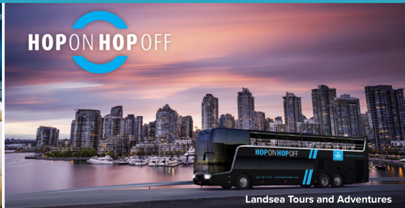
Landsea Tours and Adventures