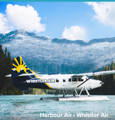
Harbour Air | Whistler Air