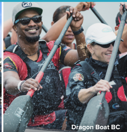
Dragon Boat BC