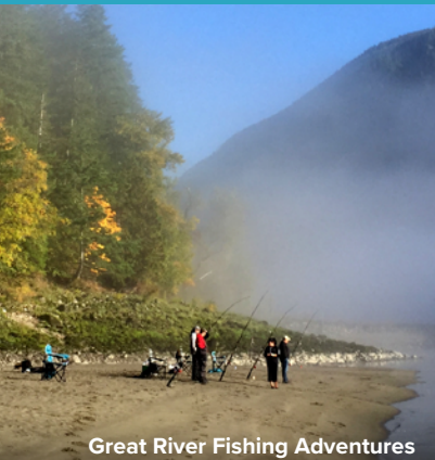
Great River Fishing Adventures