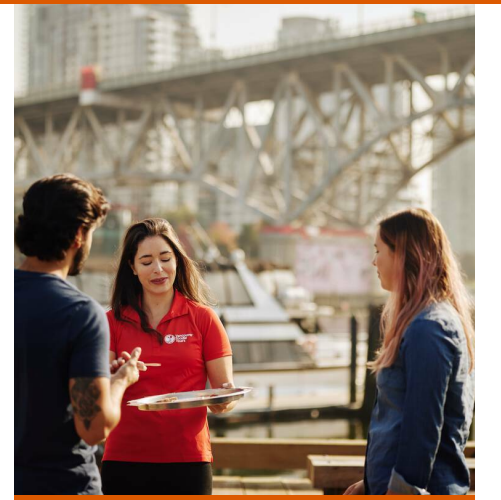
Vancouver Foodie Tours