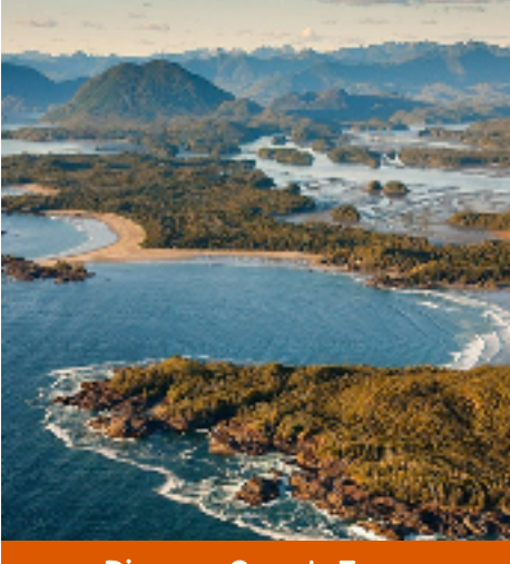
Discover Canada Tours