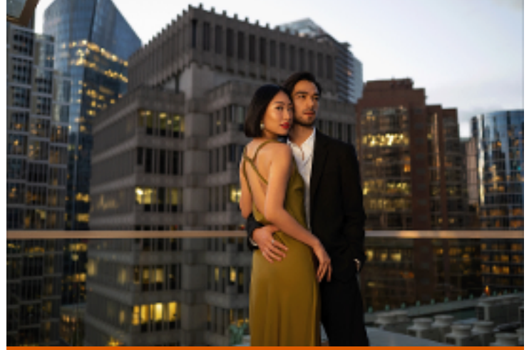
Lavantine Restaurant & Skybar