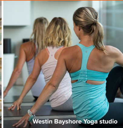
Westin Bayshore Yoga studio