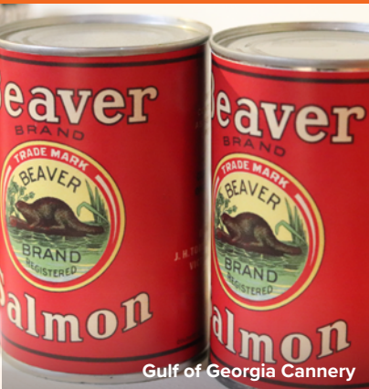
Gulf of Georgia Cannery