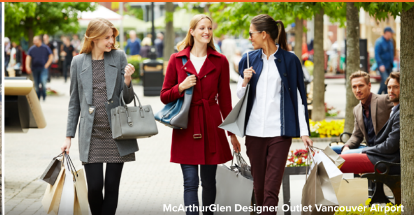
McArthurGlen Designer Outlet Vancouver Airport