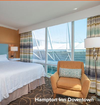
Hampton Inn Downtown