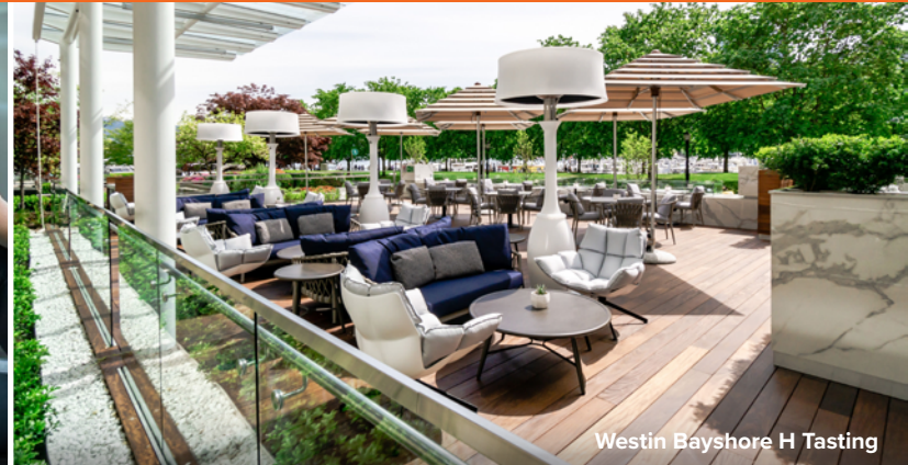
Westin Bayshore H Tasting