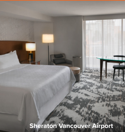
Sheraton Vancouver Airport