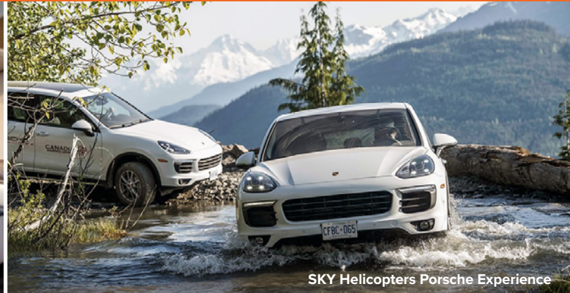
SKY Helicopters Porsche Experience