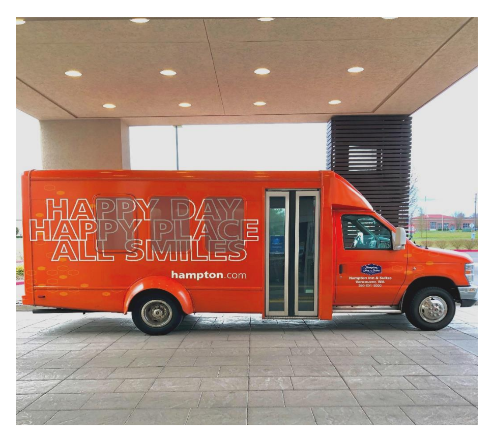
Our shuttle provides complimentary transportation to and from the Portland, Oregon airport and locally within 5 miles of the hotel.