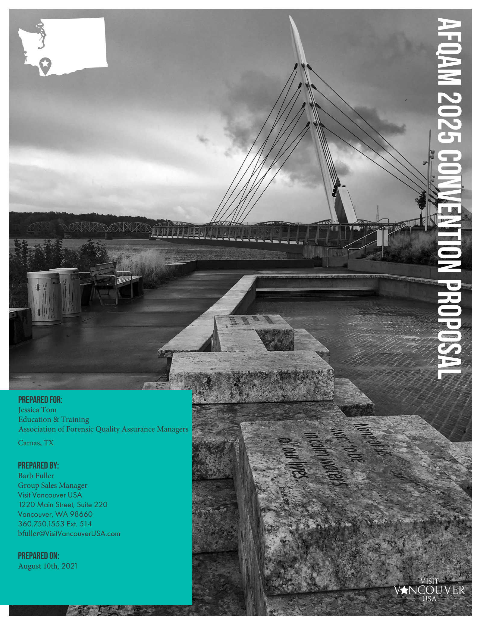
The information contained within is confidential and intended for the recipient only