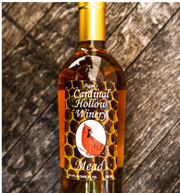
Boyd's Cardinal Hollow Winery

Exhausted your go-to at home dinner recipes? Montgomery County gets it, and we're here for you. Enjoy local favorites from the comfort of your own home with take-out and delivery from Montco's 1,600+ restaurants :