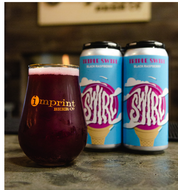
Imprint Beer Co.