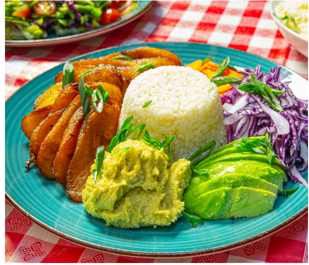
Welcome to the Avenue

Exhausted your go-to at home dinner recipes? Montgomery County gets it, and we're here for you. Enjoy local favorites from the comfort of your own home with take-out and delivery from Montco's 1,600+ restaurants :