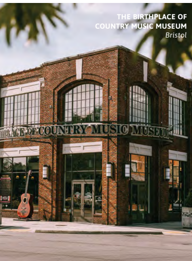
THE BIRTHPLACE OF COUNTRY MUSIC MUSEUM Bristol