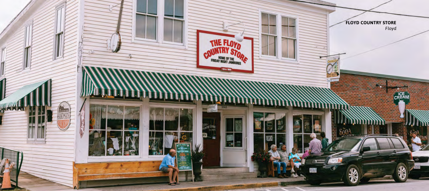
FLOYD COUNTRY STORE Floyd