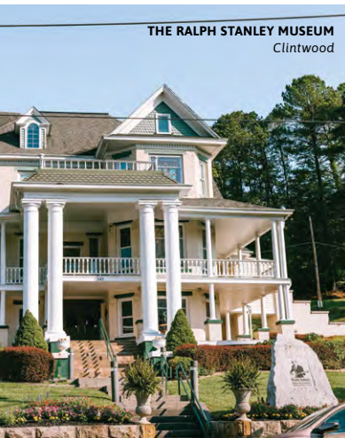
THE RALPH STANLEY MUSEUM Clintwood