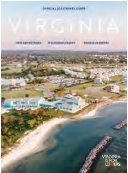
Cape Charles