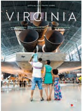
Steven F. Udvar-Hazy Center