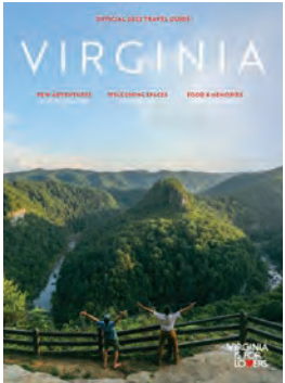
Breaks Interstate Park

EDITOR'S NOTE: For the latest travel information and safety guidelines, please visit virginia.org/covid .