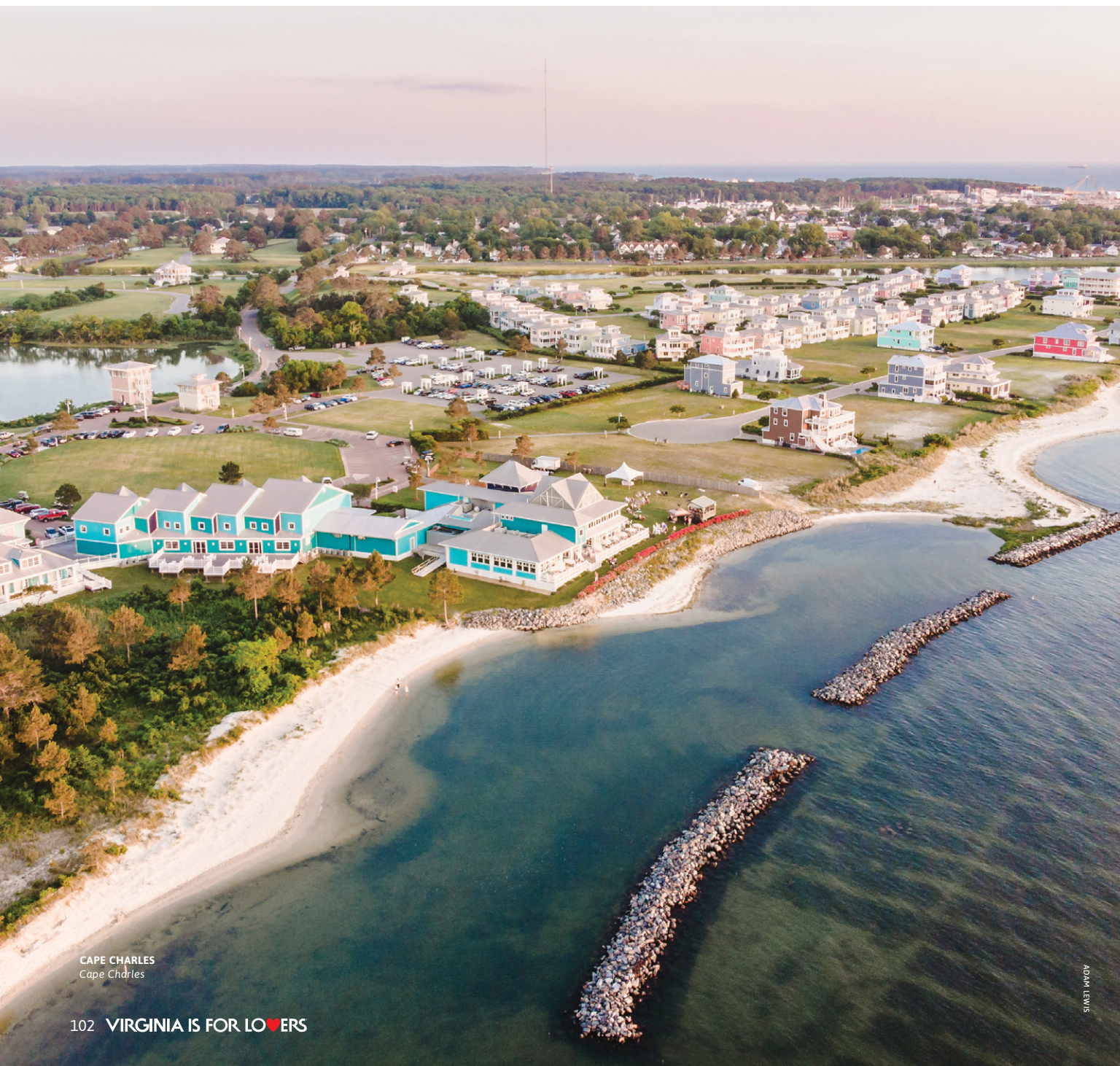
CAPE CHARLES Cape Charles

Welcome to Virginia's Eastern Shore, a breathtaking 70-mile peninsula nestled between the tranquil Chesapeake Bay and the majestic Atlantic Ocean. Indulge in delectable seafood, explore coastal farms, see the enchanting Chincoteague ponies, and traverse the engineering marvel of the Chesapeake Bay Bridge Tunnel. This pristine isle is a haven for both nature enthusiasts and adventure seekers alike.