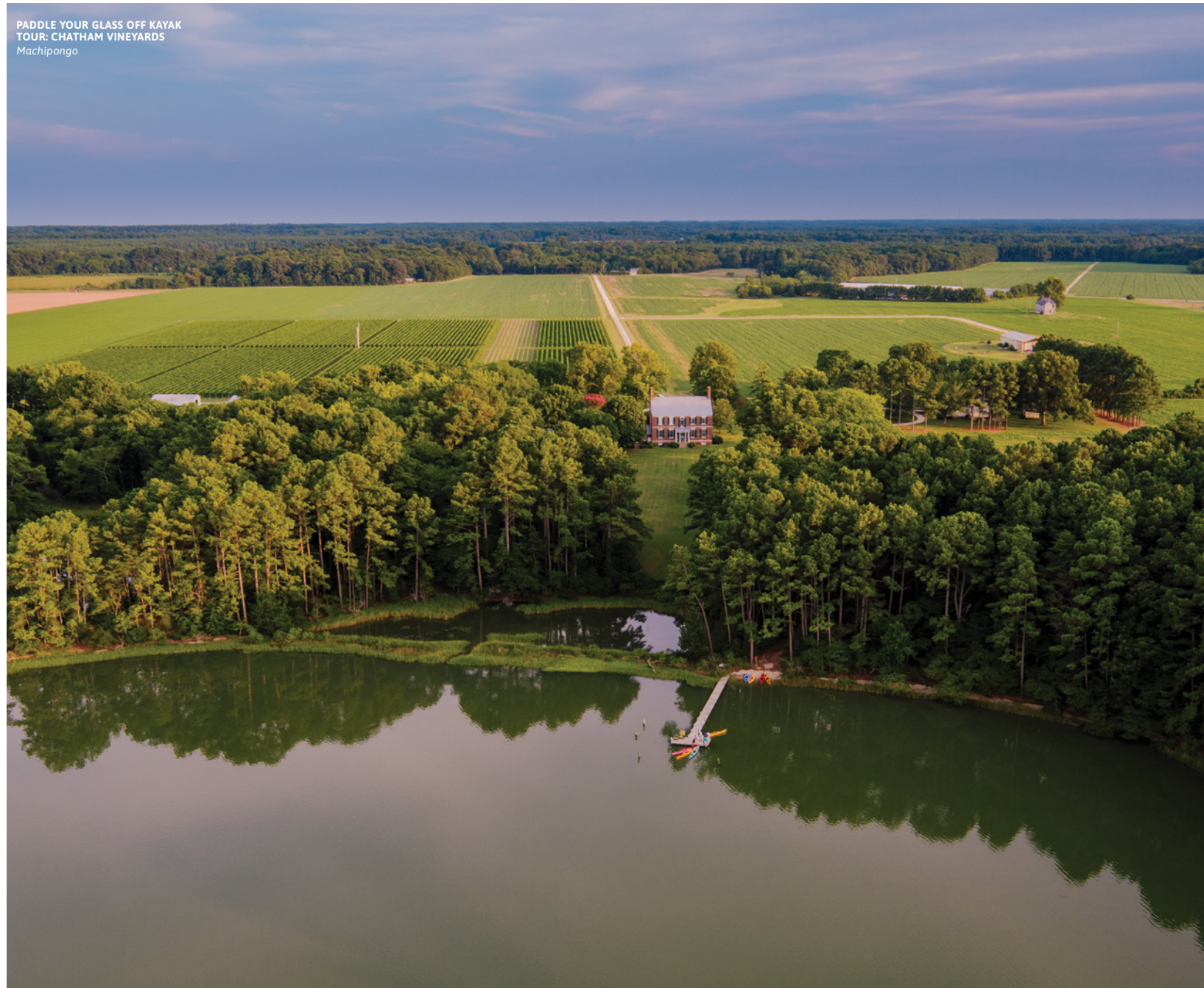
PADDLE YOUR GLASS OFF KAYAK TOUR: CHATHAM VINEYARDS Machipongo

Pear Valley Pear Cottage Dr., Wilsonia Neck, Machipongo; 757-331-4689; preservationvirginia.org/visit/historic-properties/pear-valley. Structure dates to 1740. By appointment only.