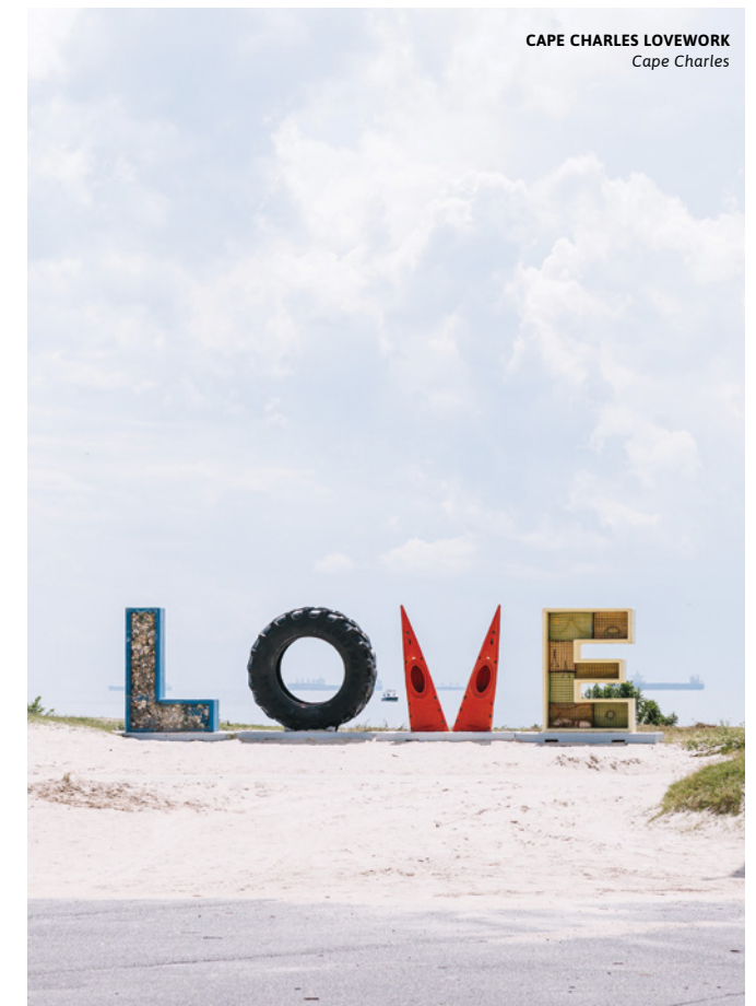
CAPE CHARLES LOVEWORK Cape Charles