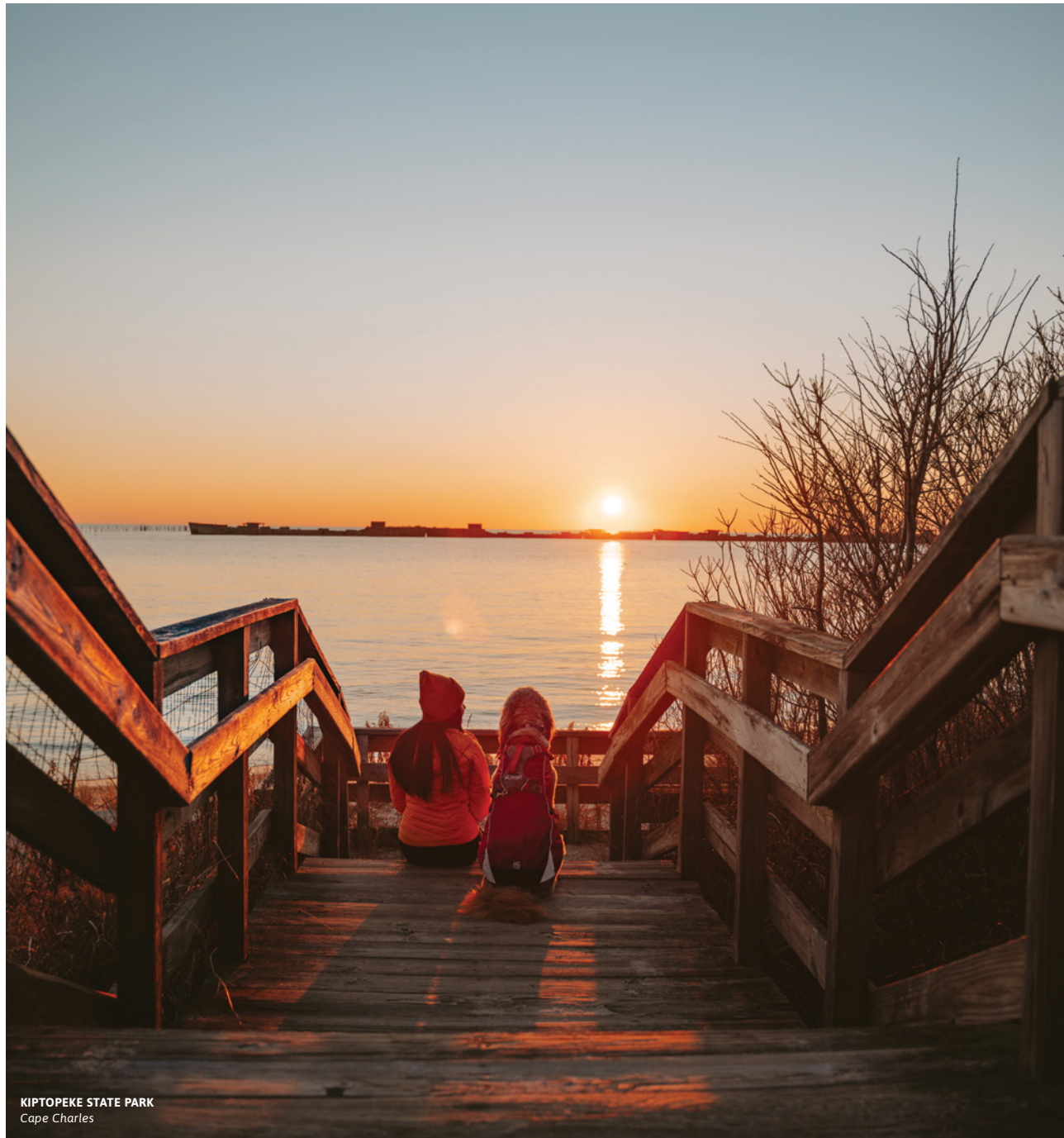
KIPTOPEKE STATE PARK Cape Charles

The small coastal towns that line the 70-mile peninsula between the Chesapeake Bay and the Atlantic Ocean offer delectable seafood, sandy beaches, serene marshy landscapes, barrier islands, and the famous wild ponies of Chincoteague.