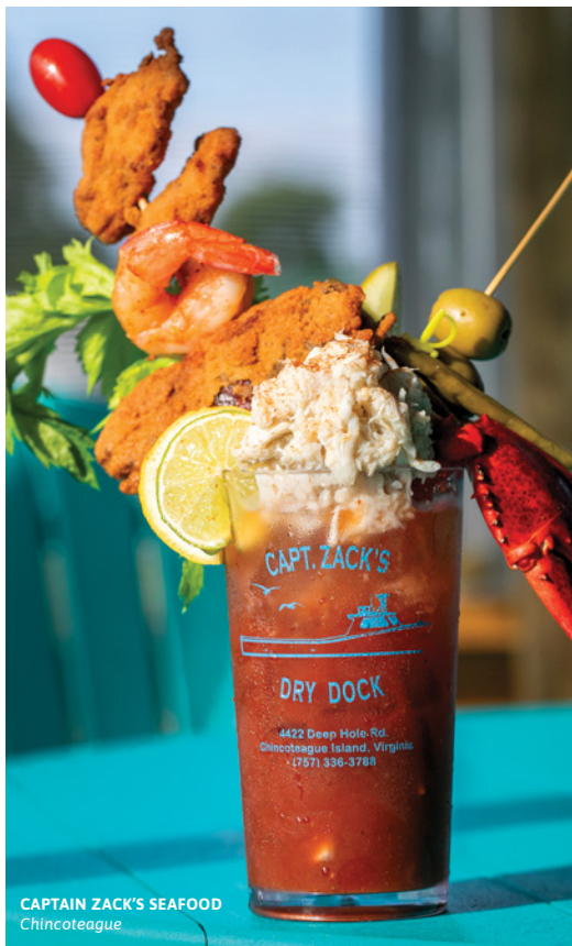
CAPTAIN ZACK'S SEAFOOD Chincoteague

Welcome Center at New Church Virginia Tourism Corporation Access U.S. Rt.13 North & Southbound U.S. 13, 3420 Lankford Hwy. New Church, VA 23415 757-824-5000