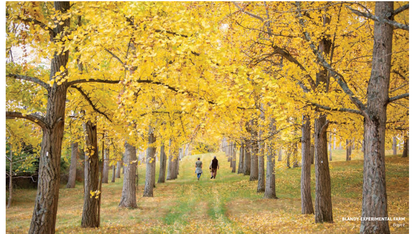
BLANDY EXPERIMENTAL FARM Boyce

The SHENANDOAH VALLEY reveals stunning natural beauty with each changing season. With the Blue Ridge Mountains to the east and Alleghenies to the west, its rich agricultural roots have created ample opportunity to reconnect with both the land and the locals – at pick-your own farms, family-owned wineries and breweries, and authentic farm-to-table experiences. Straddling Interstate 81 for approximately 140 miles, this region is the ideal getaway for friends and families seeking fresh-air fun, coupling word-class outdoor assets and mountain-centric resorts and cabins.