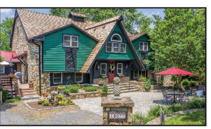
Stone Gables Bed & Breakfast Luxurious Comfort Stone Barn Lodging Stonegables-bb.com