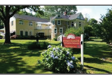
Stone Manor Boutique Inn Luxury B&B and Country Retreat Virginiabandb.net