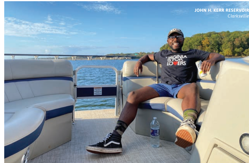
JOHN H. KERR RESERVOIR Clarksville

Add these experiences to your travel bucket list for the region!