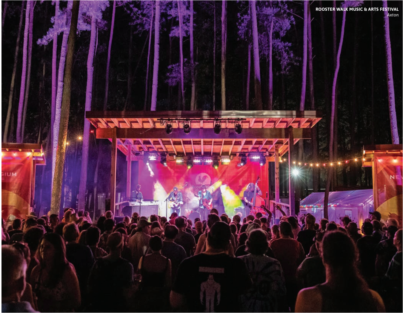
ROOSTER WALK MUSIC & ARTS FESTIVAL Axton

Welcome Center at Bracey Virginia Tourism Corporation Mile Marker 1, I-85 Northbound Bracey 23919 434-689-2295 Welcome Center at Skippers Virginia Tourism Corporation Mile Marker 0, I-95 Northbound Skippers 23879 434-634-4113 Civil Rights in Education Heritage Trail People's Community Center, 1021 Tidewater Ave., Victoria; 434-696-2456; varetreat.com/civilrights.asp. Second location at Matthew's Lutheran Church Christian Day School. Civil War Wilson-Kautz Raid Tour St. John's Church, corner of Broad & Shade Streets, Kenbridge; 434-696-2546; civilwartraveler.com. Part of a self-guided driving tour following the Raid's locations.