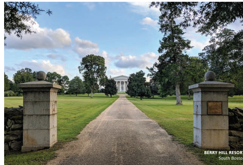
BERRY HILL RESORT South Boston

This freshwater nighttime event boasts 76 fluorescent green Hydro Glow lights that not only make night fishing fun, but fruitful, as the glow of underwater lights attracts millions of tiny feeder fish that attract even larger game fish. It's the perfect sport for those who sunburn easily, want to maximize the day's catch or simply try something a little off the beaten path.