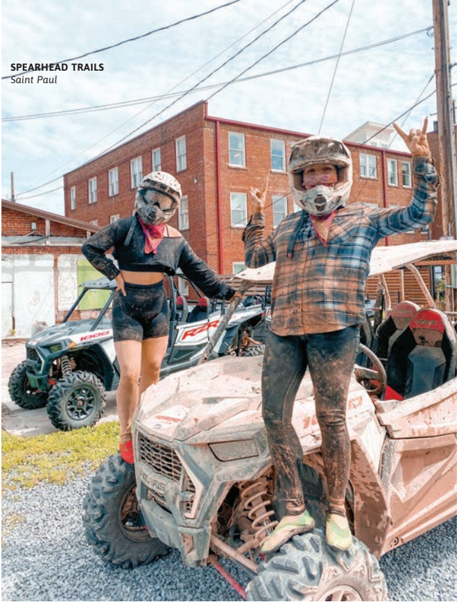
SPEARHEAD TRAILS Saint Paul

Add these experiences to your travel bucket list for the region!