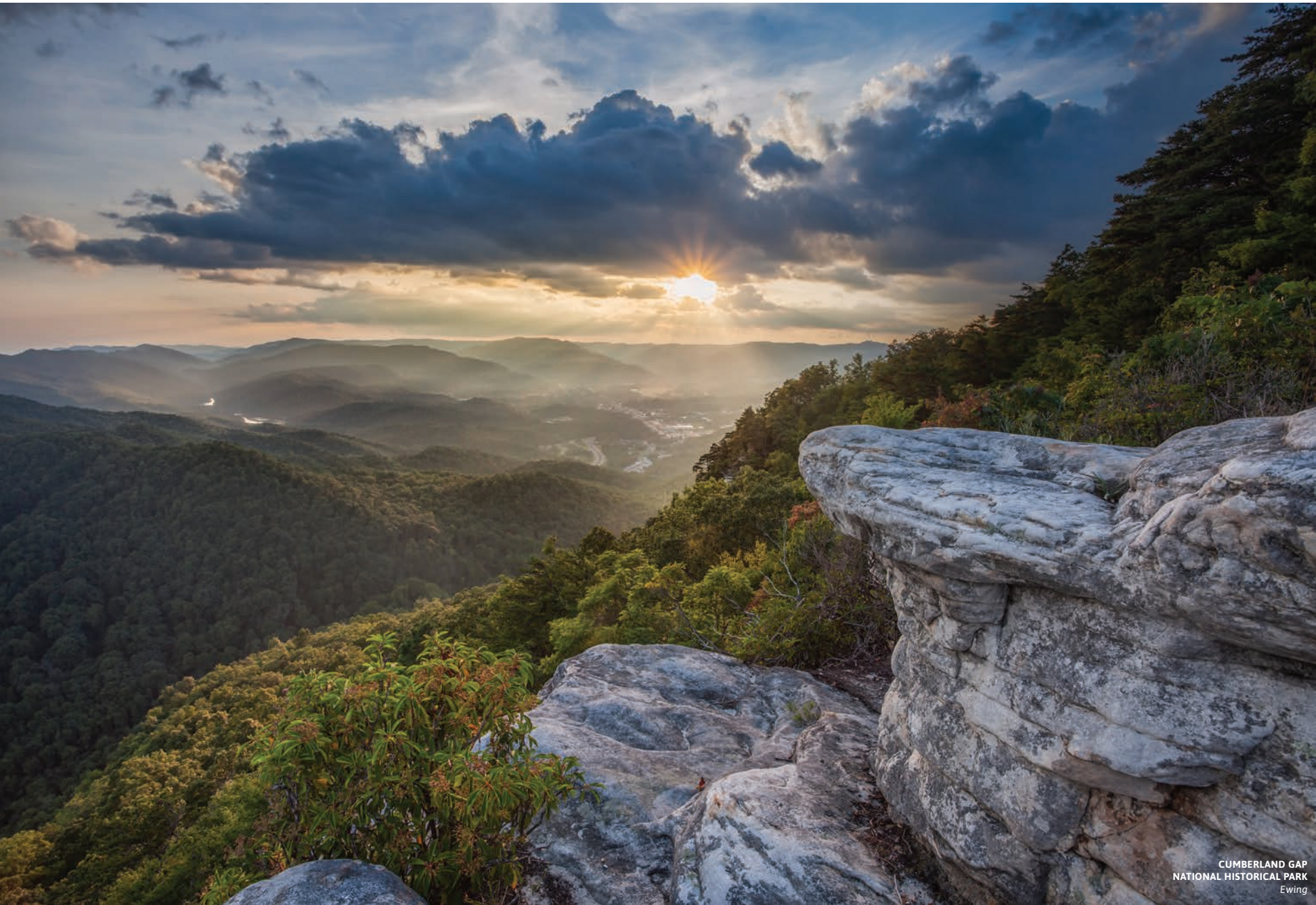
CUMBERLAND GAP NATIONAL HISTORICAL PARK Ewing