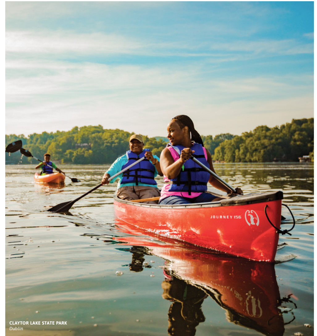
CLAYTOR LAKE STATE PARK Dublin

This region is home to a beautiful piece of the Appalachian Trail. What's fantastic is its accessibility - you can choose a beautiful mild hike for the day or go all in and camp for days. The choice is up to you.