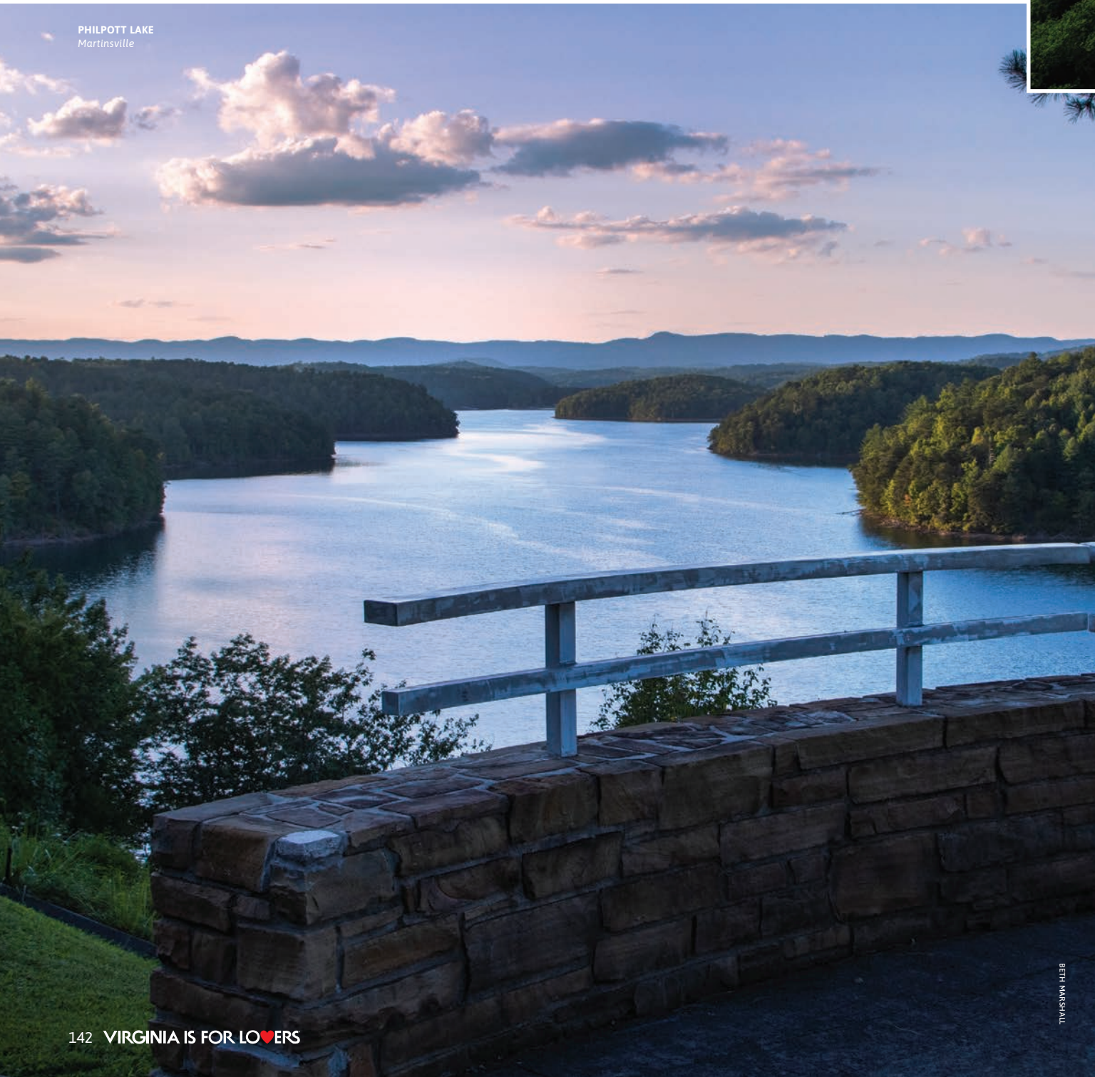
PHILPOTT LAKE Martinsville

Welcome to the Southern Virginia region, where the captivating transformation from the historic tobacco hub to Virginia's thrilling racing region awaits you. Embrace the adrenaline as you engage in the heart of speed with six world-class speedways and raceways that promise an unforgettable experience for every motorsport enthusiast.