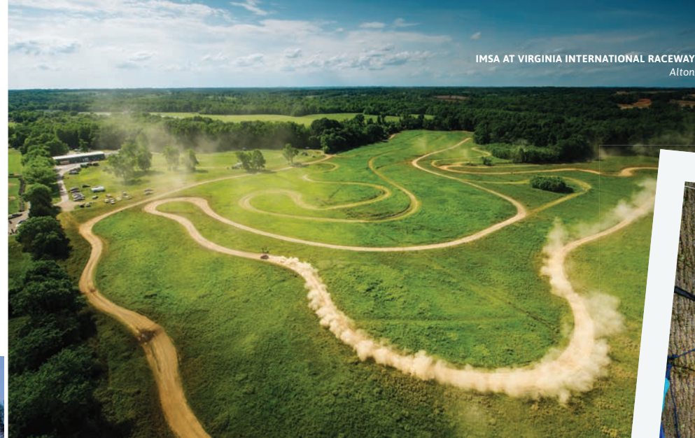
IMSA AT VIRGINIA INTERNATIONAL RACEWAY Alton