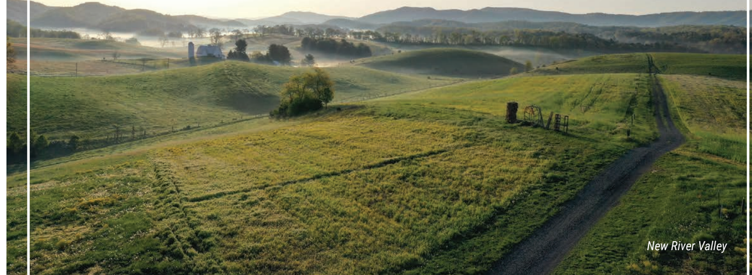
New River Valley