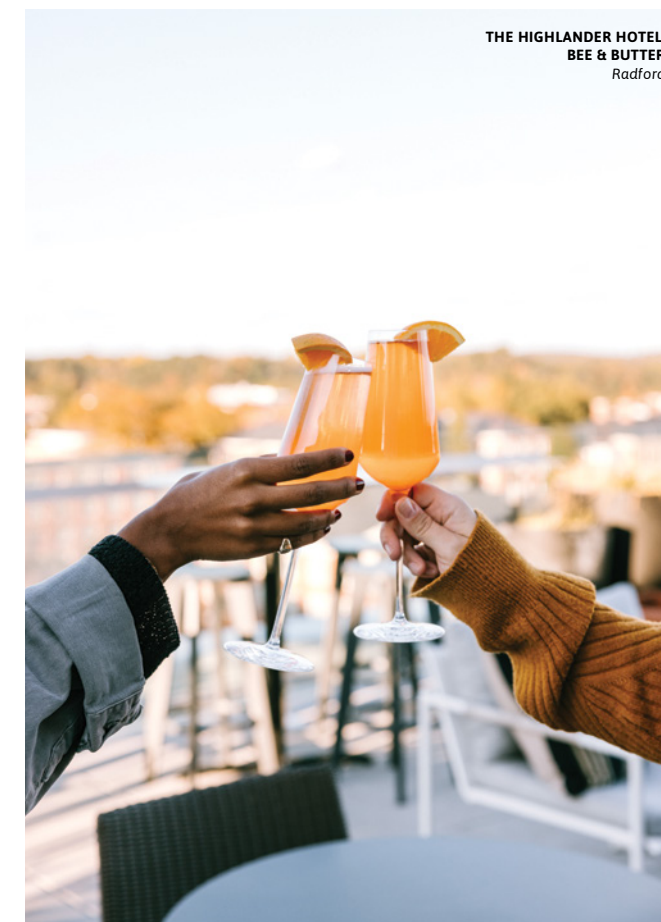
THE HIGHLANDER HOTEL: BEE & BUTTER Radford