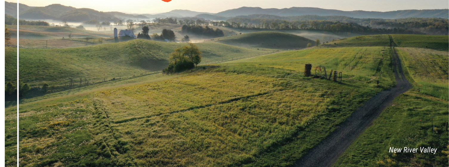
New River Valley