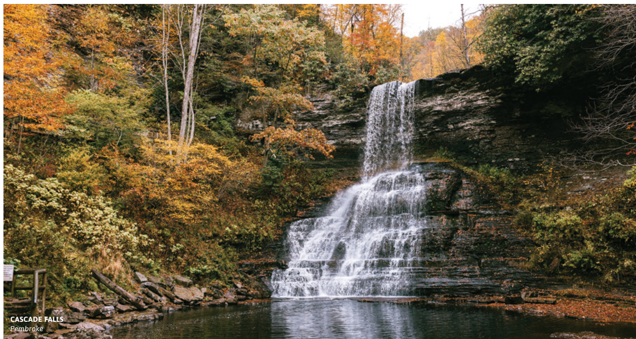
CASCADE FALLS Pembroke