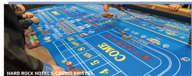
HARD ROCK HOTEL & CASINO BRISTOL