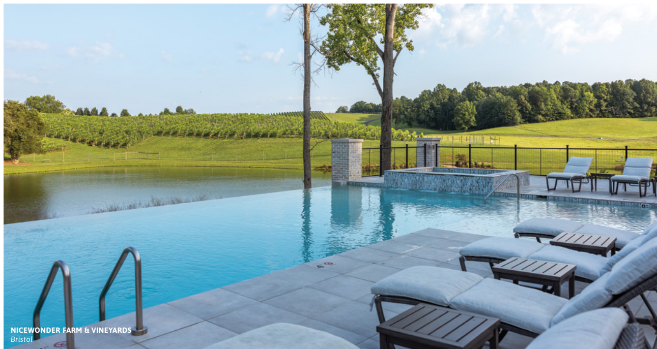
NICEWONDER FARM & VINEYARDS Bristol

The Blue Ridge Highlands is known for its rich Appalachian music heritage and mountain scenery. It's home to Virginia's tallest peak, the legendary wild ponies of Grayson Highlands, and a brand-new casino in Bristol: Hard Rock Hotel & Casino Bristol.