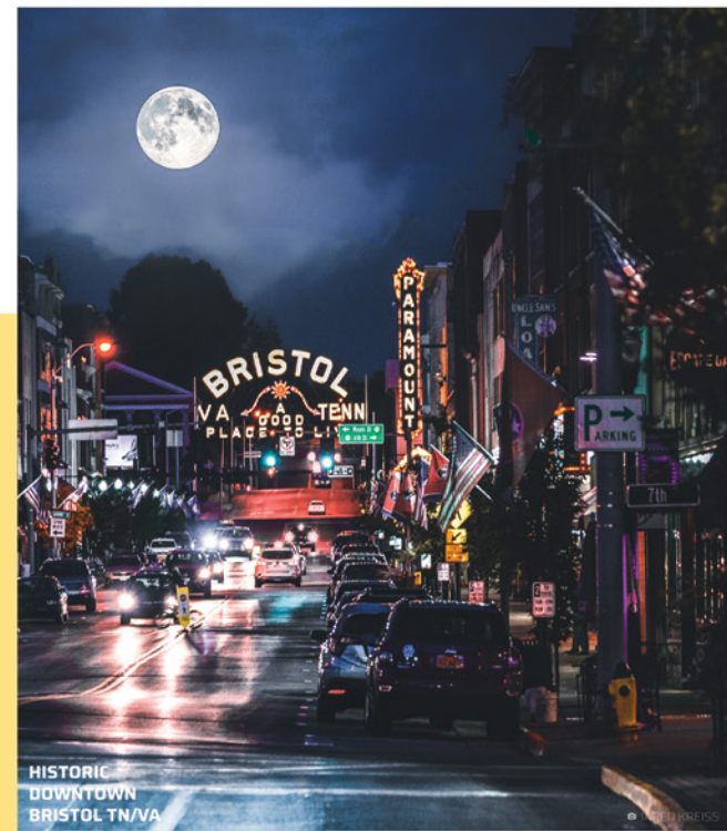
HISTORIC DOWNTOWN BRISTOL TN/VA

You can't miss a trip to the Birthplace of Country Music Museum located in historic Downtown Bristol , which tells the story of the 1927 Bristol Sessions - recordings that were influential in shaping early commercial country music's sounds and practices.