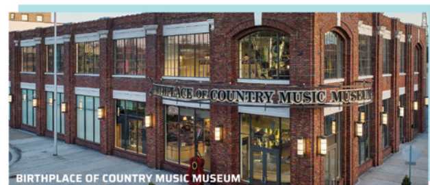
BIRTHPLACE OF COUNTRY MUSIC MUSEUM

The Bristol region features more than 40 square miles of inland lakes, rivers, and freshwater streams, including South Holston Lake and Holston River - home to world-class fly fishing - as well as hiking, biking and scenic views. Or hiking and biking enthusiasts can explore the Mendota Trail , a 12.5-mile scenic trail connecting Bristol and Mendota.