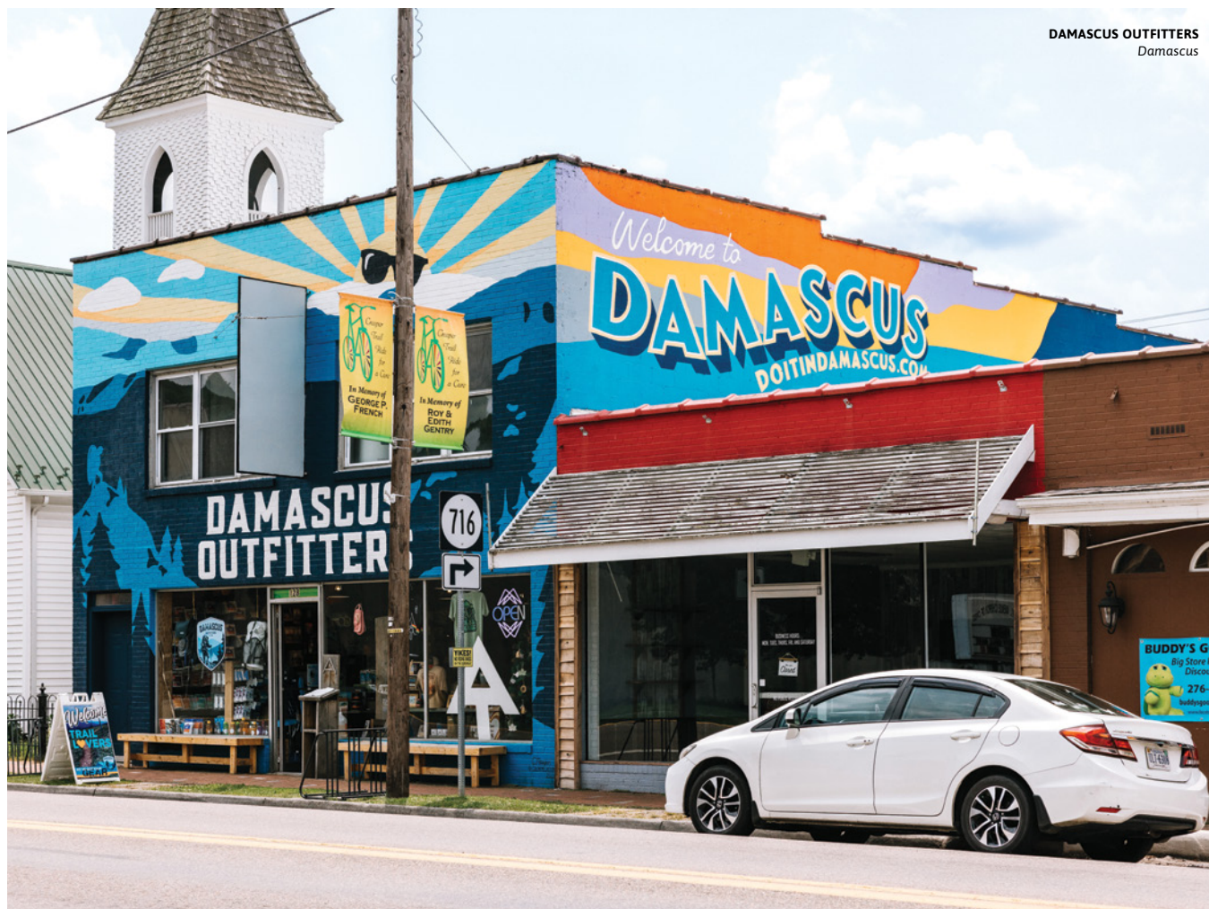
DAMASCUS OUTFITTERS Damascus

Coal Mining Heritage Park Mile 4 of The Huckleberry Trl., Christiansburg; 540-382-6975; montva.com/parks-and-rec/parks-facilities/coal-mining-heritage-park. The former Merrimac Mine is a passive park and trail. 🐾