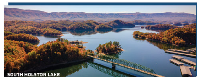
SOUTH HOLSTON LAKE