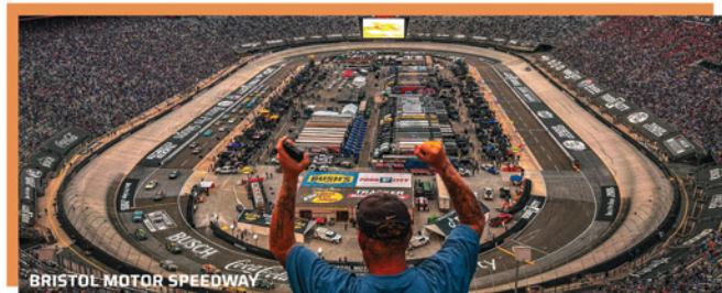
BRISTOL MOTOR SPEEDWAY

Bristol Motor Speedway , one of NASCAR's most popular tracks, is a must, as is having your photo taken in front of the "It's Bristol Baby" sign which sits right outside the massive track, and hosts two NASCAR series races each year.