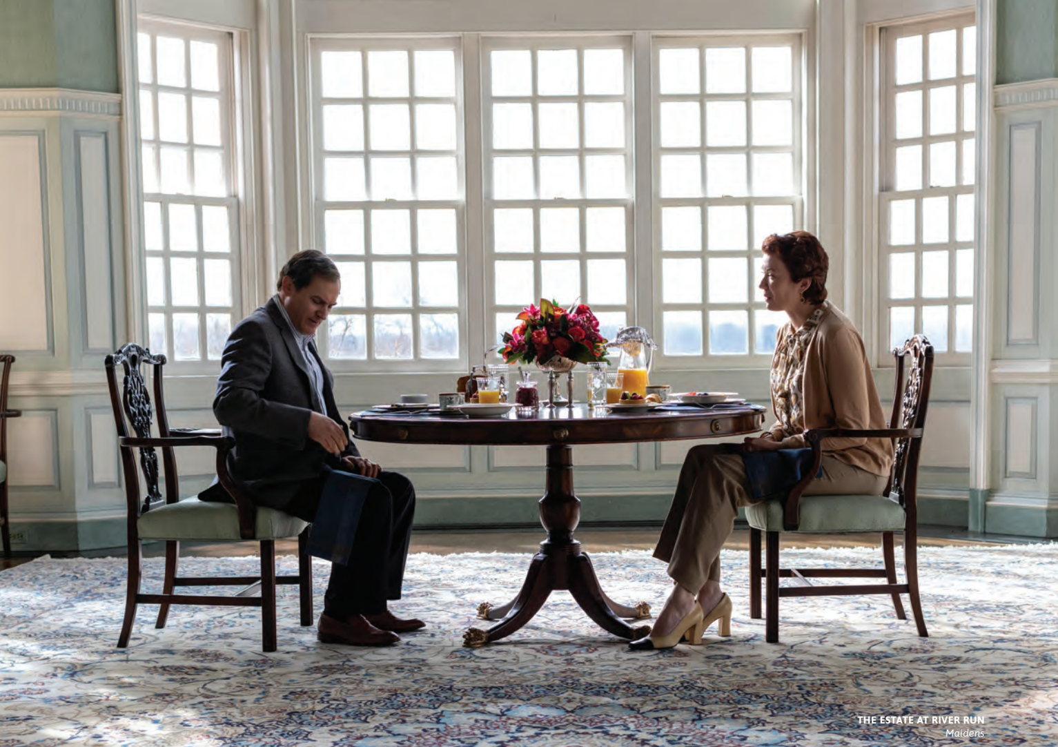
THE ESTATE AT RIVER RUN Maidens