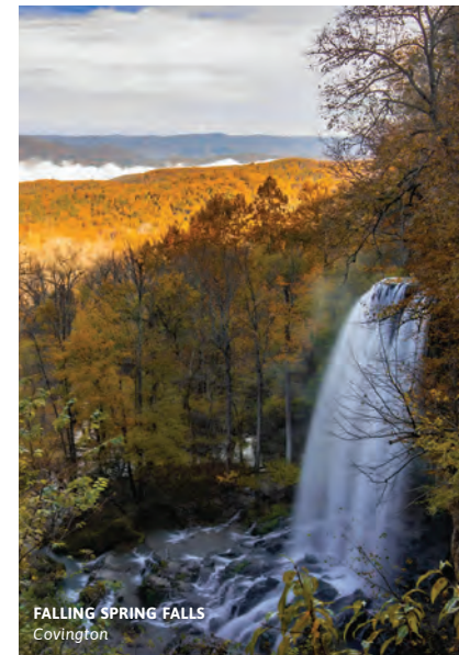
FALLING SPRING FALLS Covington

Head to virginia.org/film to learn more!