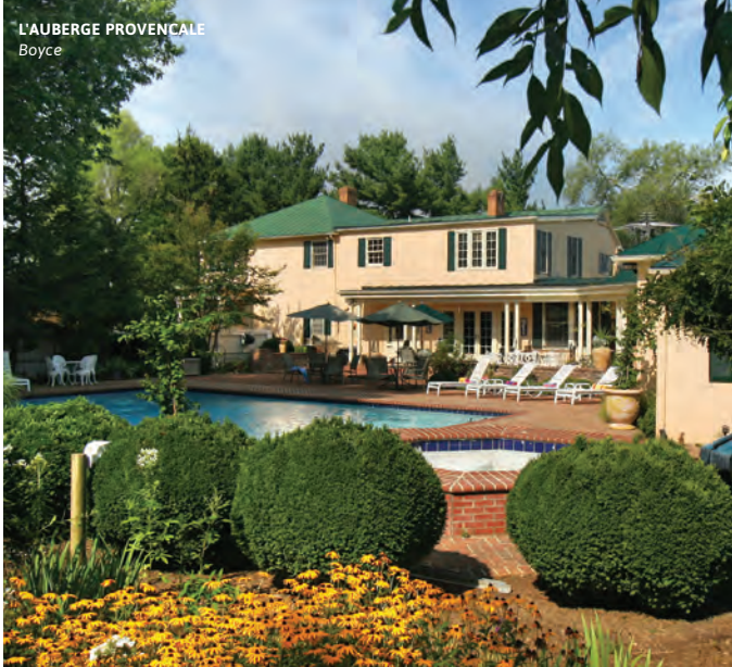
L'AUBERGE PROVENCAL Boyce