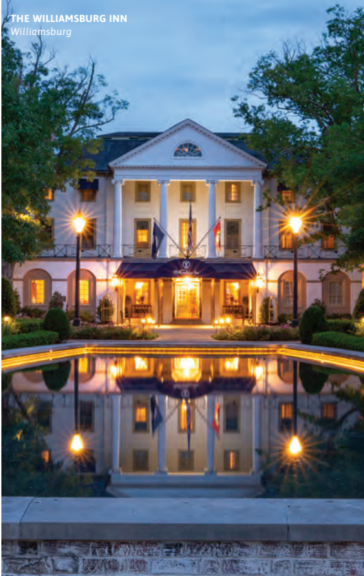
THE WILLIAMSBURG INN Williamsburg