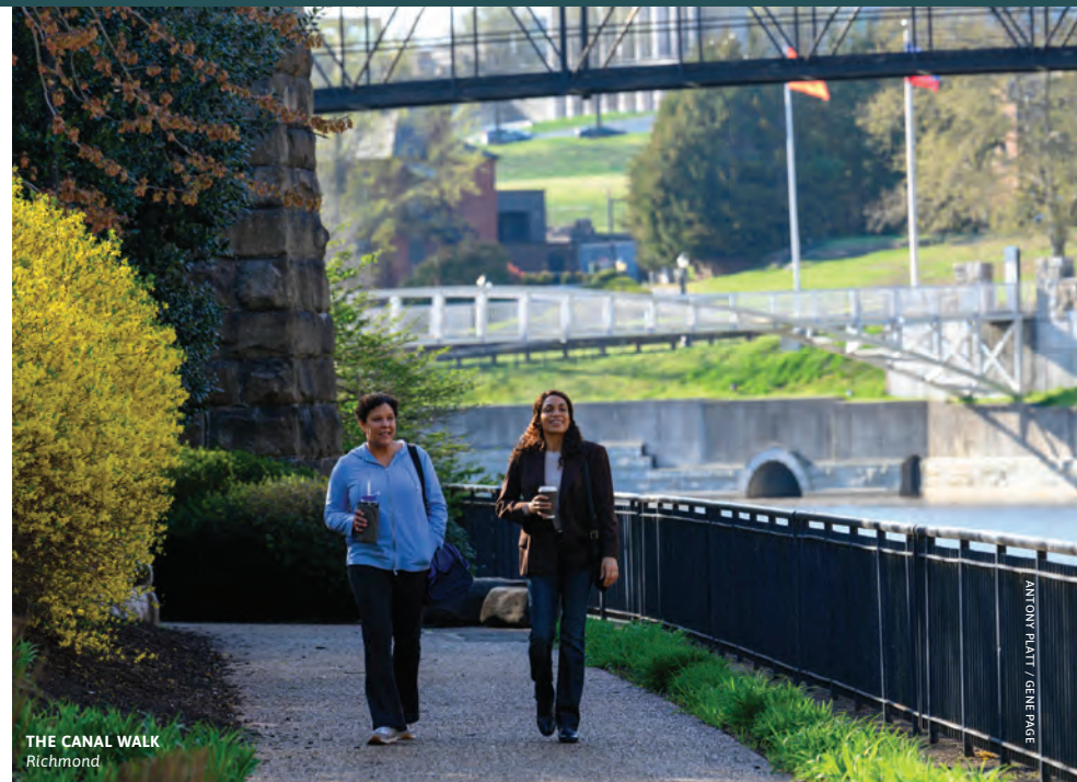
THE CANAL WALK Richmond