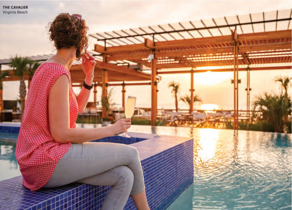
THE CAVALIER Virginia Beach