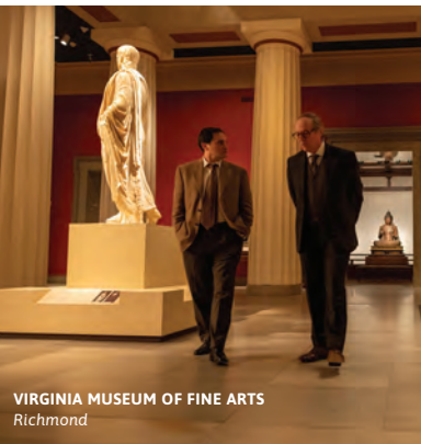
VIRGINIA MUSEUM OF FINE ARTS Richmond

THE BACKROADS TOUR OF VIRGINIA. SANS THE ROAD.