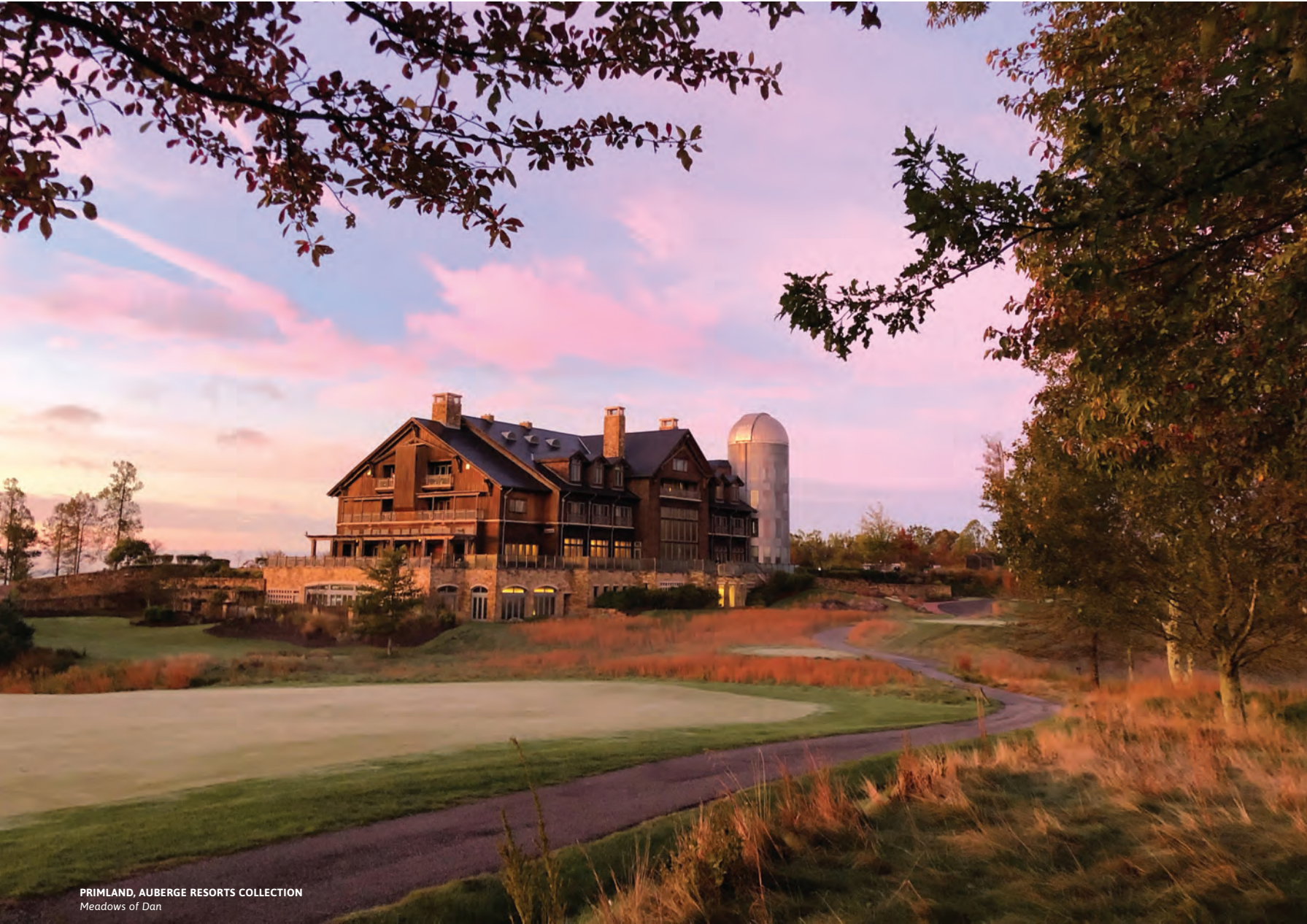
PRIMLAND, AUBERGE RESORTS COLLECTION Meadows of Dan

Virginia offers a distinct type of luxury: picturesque scenic byways lead travelers past sparkling waterways, through rolling green countryside and across stunning mountain peaks to find five-star resorts, spas and golf courses tucked away in quiet solitude. From best-in-class accommodations to world-renowned wines, Virginia has everything you need for an indulgent escape. Reconnect with what you love at virginia.org/luxury .