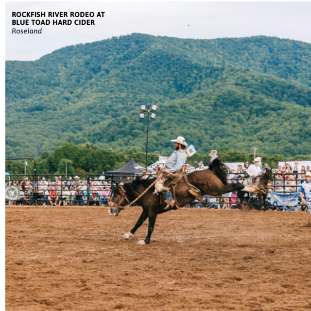
ROCKFISH RIVER RODEO AT BLUE TOAD HARD CIDER Roseland