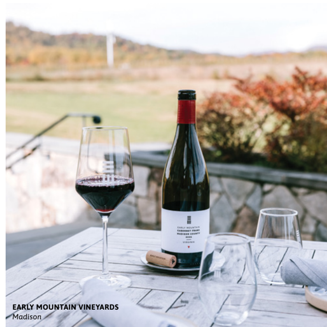
EARLY MOUNTAIN VINEYARDS Madison