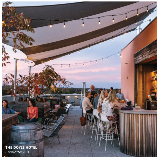
THE DOYLE HOTEL Charlottesville