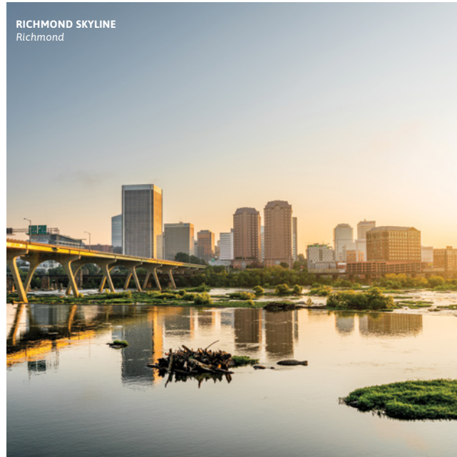
RICHMOND SKYLINE Richmond

Welcome to Central Virginia, where the past and present intertwine over a landscape that subtly changes from urban riverfronts to rolling hills and mountain-top vistas. You'll find a capital city brimming with creativity and noteworthy dining, an award-winning wine scene to the west, and a wide array of outdoor experiences throughout.