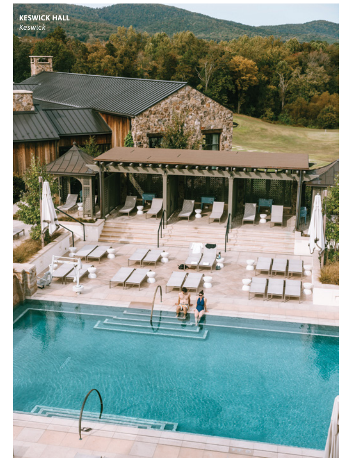
KESWICK HALL Keswick