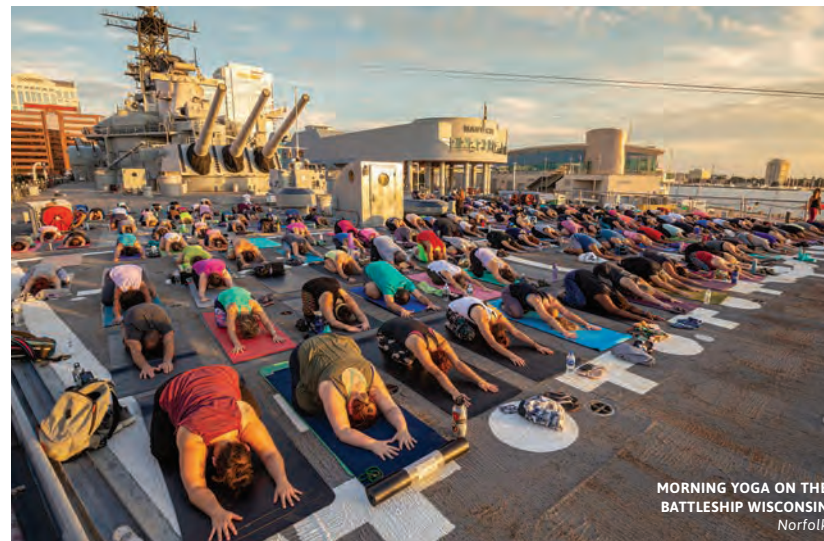
MORNING YOGA ON THE BATTLESHIP WISCONSIN Norfolk