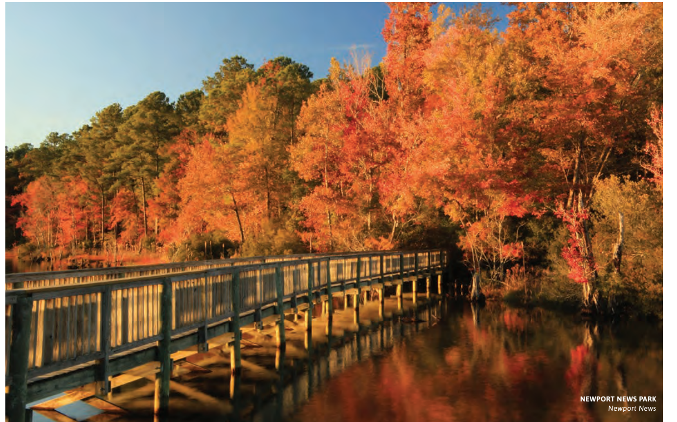
NEWPORT NEWS PARK Newport News