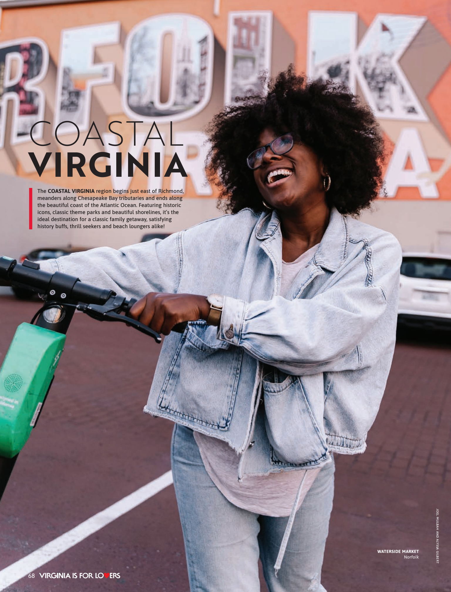
WATERSIDE MARKET Norfolk

The COASTAL VIRGINIA region begins just east of Richmond, meanders along Chesapeake Bay tributaries and ends along the beautiful coast of the Atlantic Ocean. Featuring historic icons, classic theme parks and beautiful shorelines, it's the ideal destination for a classic family getaway, satisfying history buffs, thrill seekers and beach loungers alike!