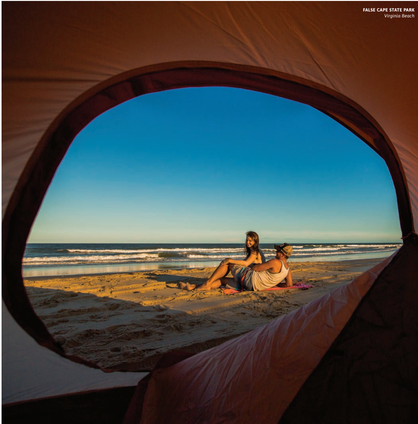
FALSE CAPE STATE PARK Virginia Beach