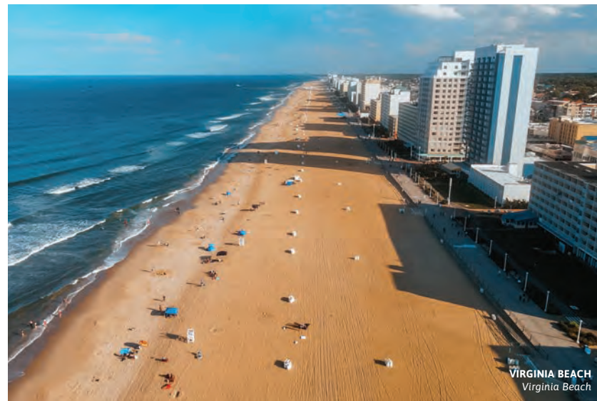
VIRGINIA BEACH Virginia Beach

Add these experiences to your travel bucket list for the region!