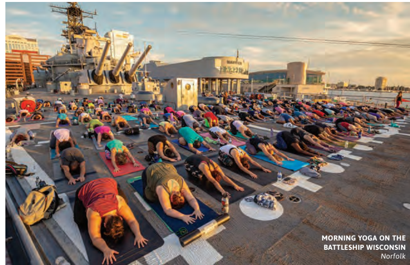
MORNING YOGA ON THE BATTLESHIP WISCONSIN Norfolk