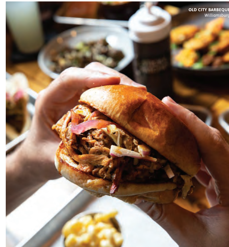
OLD CITY BARBEQUE Williamsburg

Yorktown Market Days 331 Water St., Yorktown; 757-890-5900; yorktownmarketdays.com. A cool breeze off the water; friendly faces; a variety of fresh, local food from seasonal produce, fresh flowers and baked goods to gourmet dog treats and handmade soaps and candles.