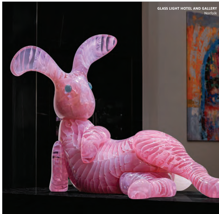
GLASS LIGHT HOTEL AND GALLERY Norfolk

Colonial Parkway From Jamestown to Williamsburg and Yorktown, Yorktown; 757-898-2410; nps.gov/colo. This scenic roadway links the primary sites of the "Historic Triangle."