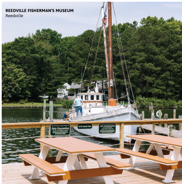
REEDVILLE FISHERMAN'S MUSEUM Reedville