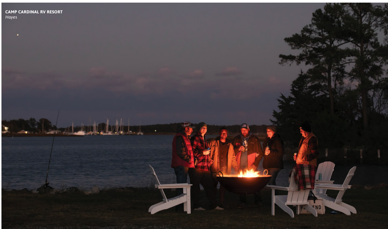
CAMP CARDINAL RV RESORT Hayes

Northern Neck Tourism Commission 457 Main St., Warsaw; 804-333-1919; northernneck.org. Designated National Heritage Area with presidential birth sites and waterfront recreation.