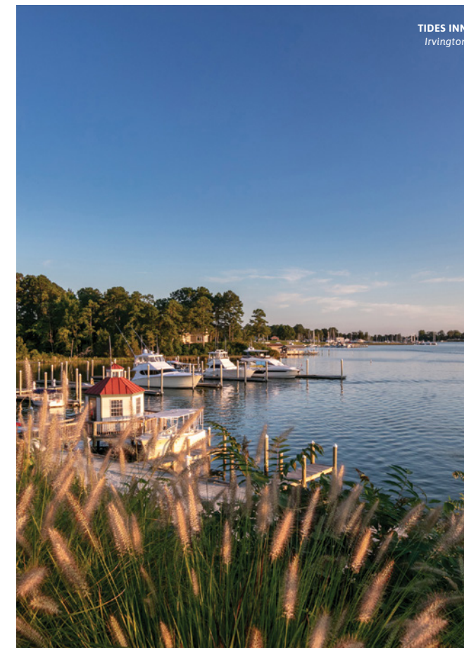
TIDES INN Irvington