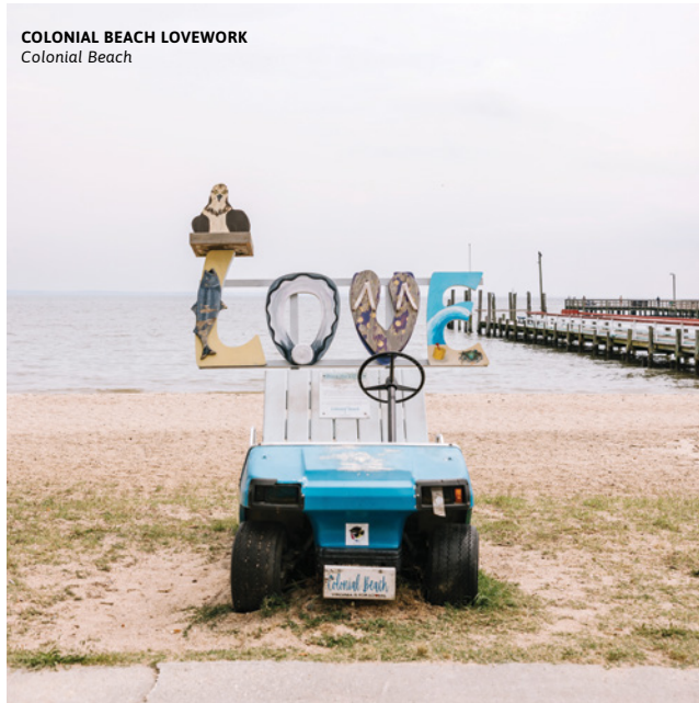
COLONIAL BEACH LOVEWORK Colonial Beach

Welcome to the Chesapeake Bay region, where quaint waterfront communities are steeped in rich history, from the Virginia Indian tribes to the watermen who carry on maritime culture and traditions. Food enthusiasts will love the abundance of seafood here, especially the local oysters.