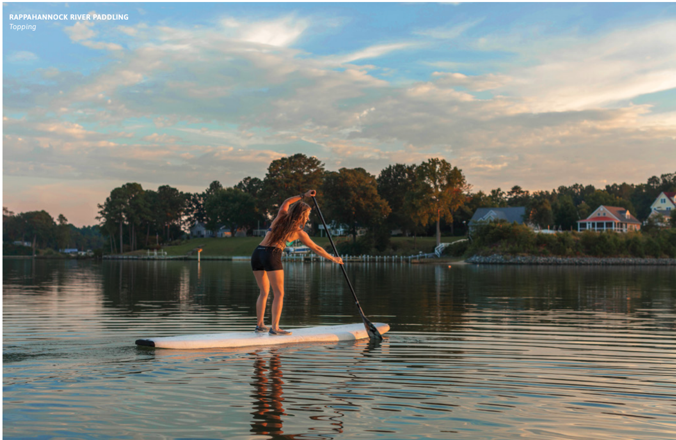
RAPPAHANNOCK RIVER PADDLING Topping