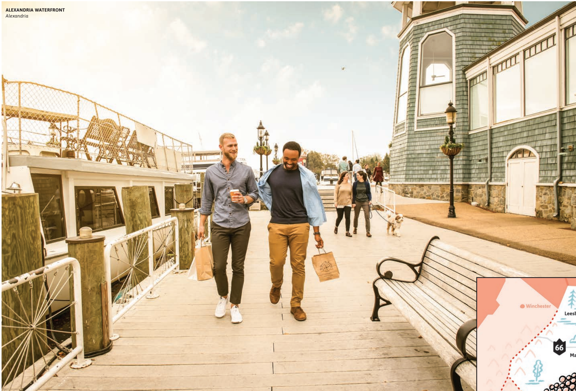
ALEXANDRIA WATERFRONT Alexandria

Just outside of the day-to-day buzz of our nation's capital, NORTHERN VIRGINIA exudes its own historical charm and cherished character. Immersed in the region's rich history, urban skylines fade into rolling countryside, encompassing everything you'd want in a getaway – whether it's live entertainment and nationally acclaimed restaurants, iconic historic sites and quaint Main Streets or wine country and luxurious retreats ... or maybe a little of each.