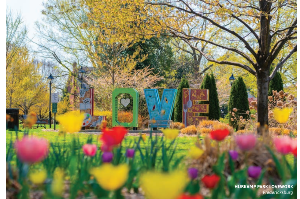
HURKAMP PARK LOVEWORK Fredericksburg

Add these experiences to your travel bucket list for the region!