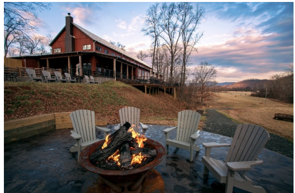
Bold Rock Hard Cider in Nellysford

Continue west to explore the many breweries around Charlottesville and along the Brew Ridge Trail . Charlottesville offers many vibrant breweries including Three Notch'd Brewing Company and South Street Brewery . Venture just outside the city to discover scenic the breweries along the Brew Ridge Trail, offering sweeping views of the Blue Ridge Mountains. Also, don't miss nearby Pro Re Nata Farm Brewery and Bold Rock Hard Cider for a quintessential Virginia craft beverage experience.