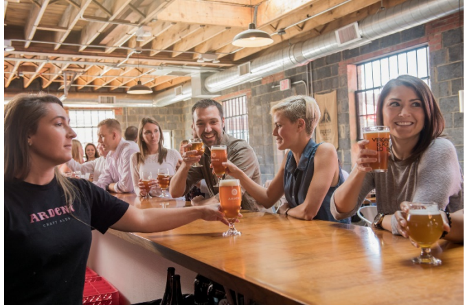
Ardent Craft Ales in Richmond

Head west and make a stop in Virginia's vibrant capital city of Richmond to experience its thriving craft beer scene. Located along the mighty James River, Richmond combines big-city amenities with warm, Southern charm. Bring your appetite, because Richmond is known for its abundant array of delicious restaurants and a booming selection of craft breweries, in addition to its historically significant cultural attractions, a vibrant arts scene, and numerous options for shopping.