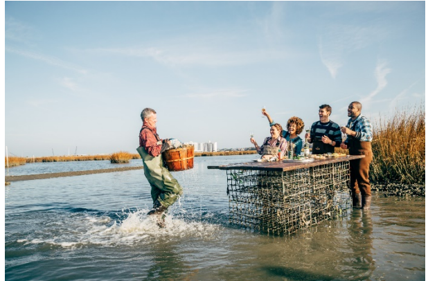
Pleasure House Oysters in Virginia Beach

Next, get ready to dazzle your taste buds with some of the region's impressive culinary offerings. Fine dining options abound in this city by the sea and seafood lovers are in for a treat, as the fresh catch found in Virginia Beach offers up an unparalleled epicurean experience. Dubbed the oyster capital of the East Coast, Virginia has eight distinct oyster regions . Try a few from each area and then pick your favorite. Some are salty, some are sweet, but they are all succulent and delicious – and they pair beautifully with a glass of Virginia wine! Check out Pleasure House Oysters for an unforgettable Virginia oyster experience.