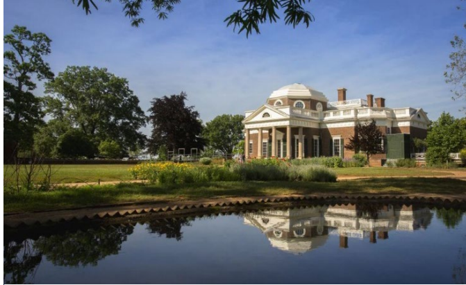
Thomas Jefferson's Monticello

Discover the rolling hills of Central Virginia , and the quaint, historic city of Charlottesville . Offering a superb taste of Virginia's history and charm, Charlottesville is home to Thomas Jefferson's Monticello and the University of Virginia (both UNESCO World Heritage sites), more than 30 wineries, and a charming pedestrian avenue filled with restaurants and boutique shops. Visit Thomas Jefferson's Monticello to learn more about how the third President of