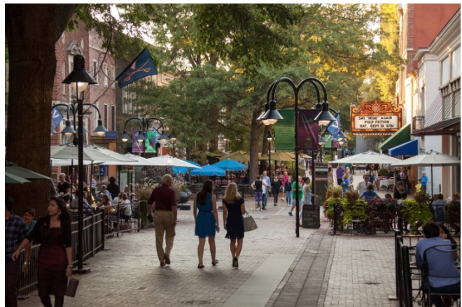
Historic Downtown Mall in Charlottesville

One of Charlottesville's most popular attractions is the historic pedestrian Downtown Mall . This eight-block avenue paved with brick, runs through the heart of Charlottesville and serves as a culinary, shopping, and arts hub. You can shop at one of the locally-owned boutiques, then dine and grab a drink at one of the many unique, trendy, or upscale restaurants. Live music and performances also regularly take place at the historic Paramount Theater , The Jefferson Theater , the Southern Café & Music Hall , and the Sprint Pavilion , an outdoor amphitheater on the Downtown Mall.