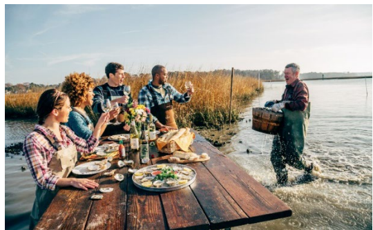
Pleasure House Oysters

Get ready to dazzle your taste buds with some of the region's impressive culinary offerings. Fine dining options abound in this city by the sea and seafood lovers are in for a treat, as the fresh catch found in Virginia Beach offers up an unparalleled epicurean experience. Dubbed the oyster capital of the East Coast, Virginia has eight distinct oyster regions . Try a few from each area and then pick your favorite. Some are salty, some are sweet, but they are all succulent and delicious – and they pair beautifully with a glass of Virginia wine! Check out Pleasure House Oysters for an unforgettable Virginia oyster experience.